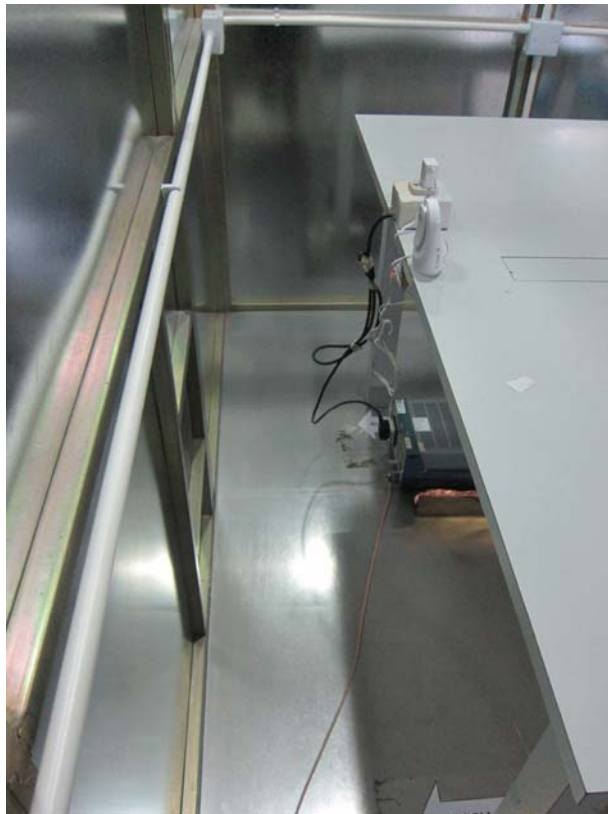
Side View 1

Test Report Number: 18010594HKG-002 FCC ID: EW780-1254-01 IC: 1135B-80125401