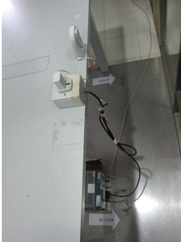
Side View 2