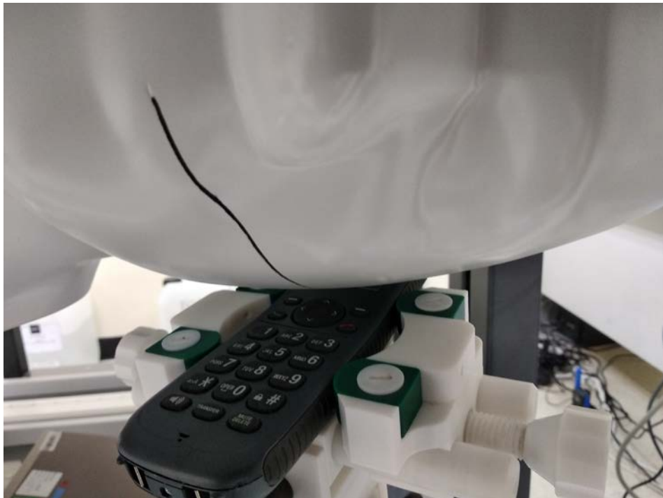
Figure 4 – Left Tilt