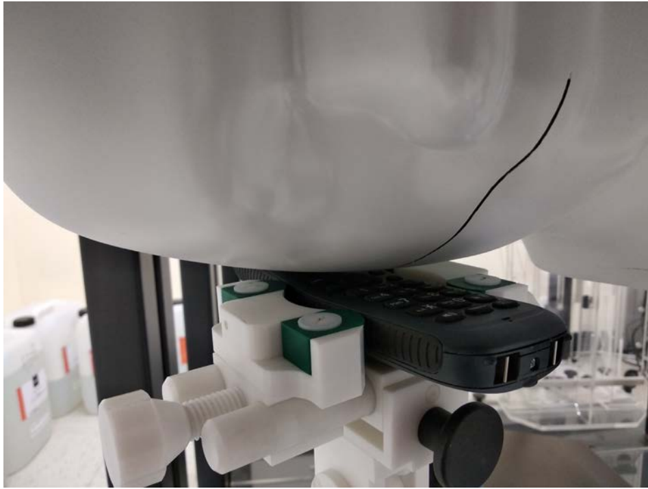
Figure 1 – Right Cheek