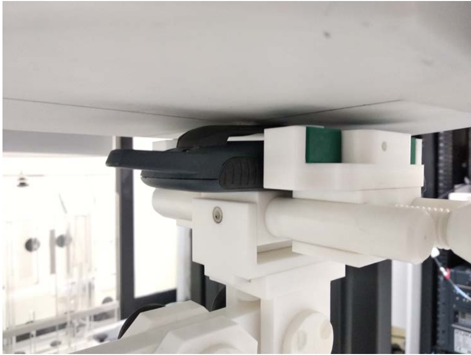
Figure 5 – Back surface with 0mm Separation