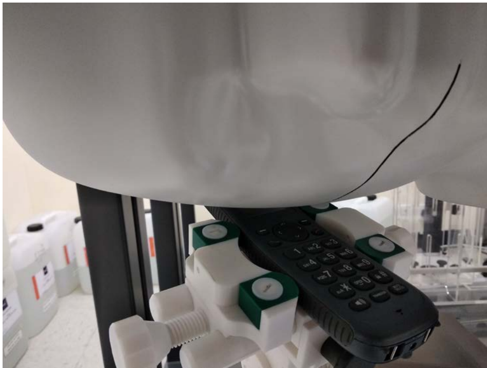
Figure 2 – Right Tilt