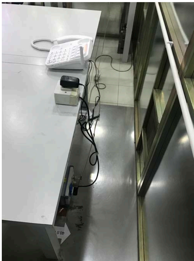
Side View 2