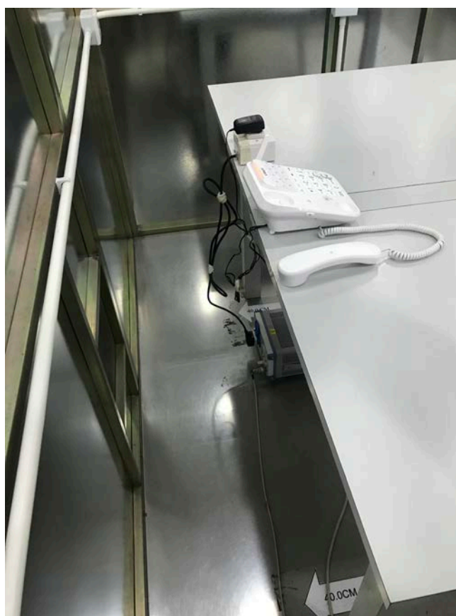
Side View 1