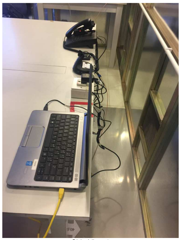
Side View 1

Test Report Number:16101132HKG-005 FCC ID: EW780-0575-00