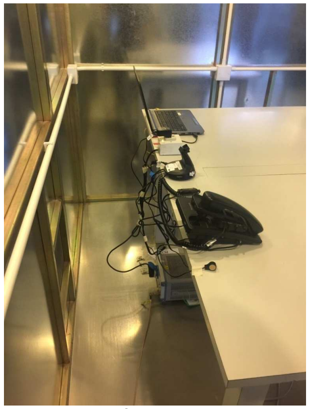
Side View 2