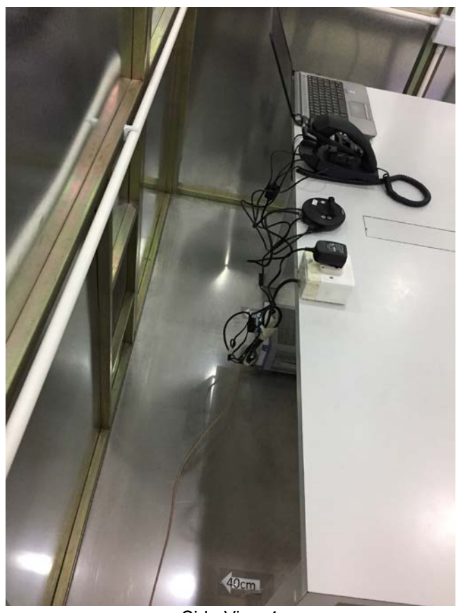
Side View 1

Test Report Number: 18081094HKG-001, 18081094HKG-002