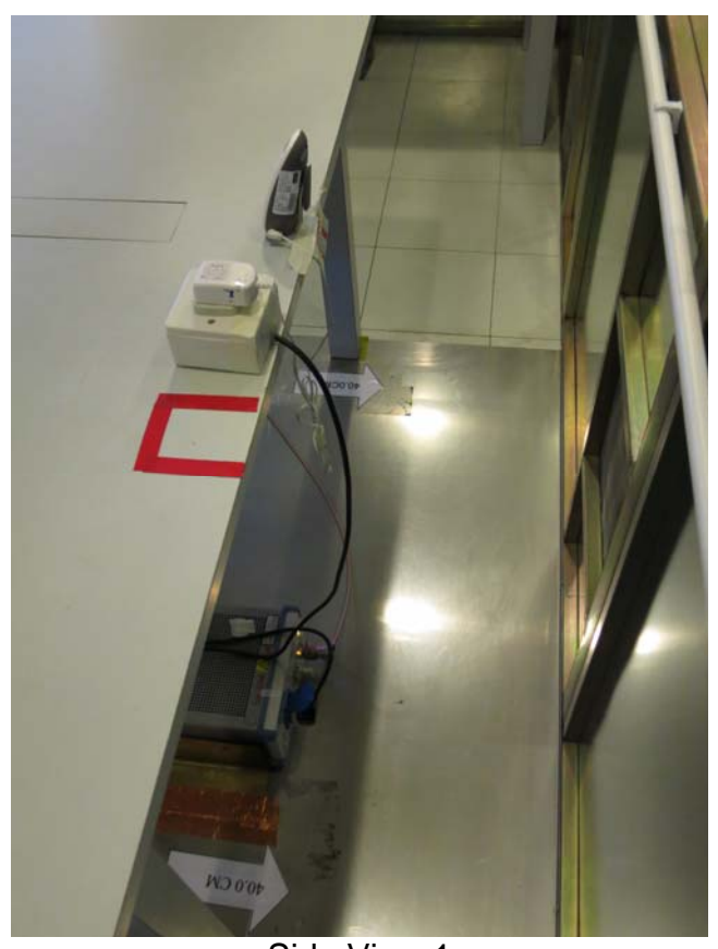
Side View 1