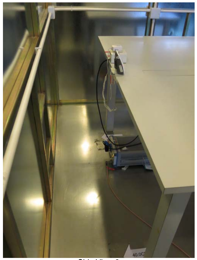
Side View 2