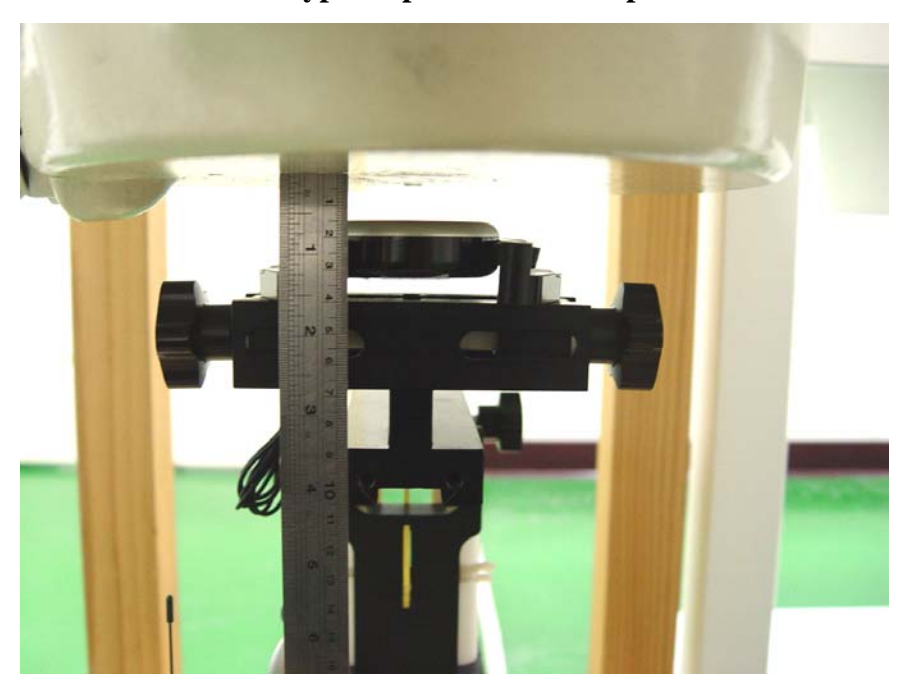
Keypad Down with 1.5cm Gap