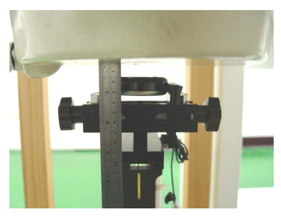
Keypad Up with 1.5cm Gap