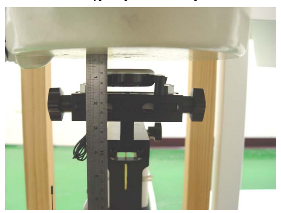
Keypad Down with 1.5cm Gap