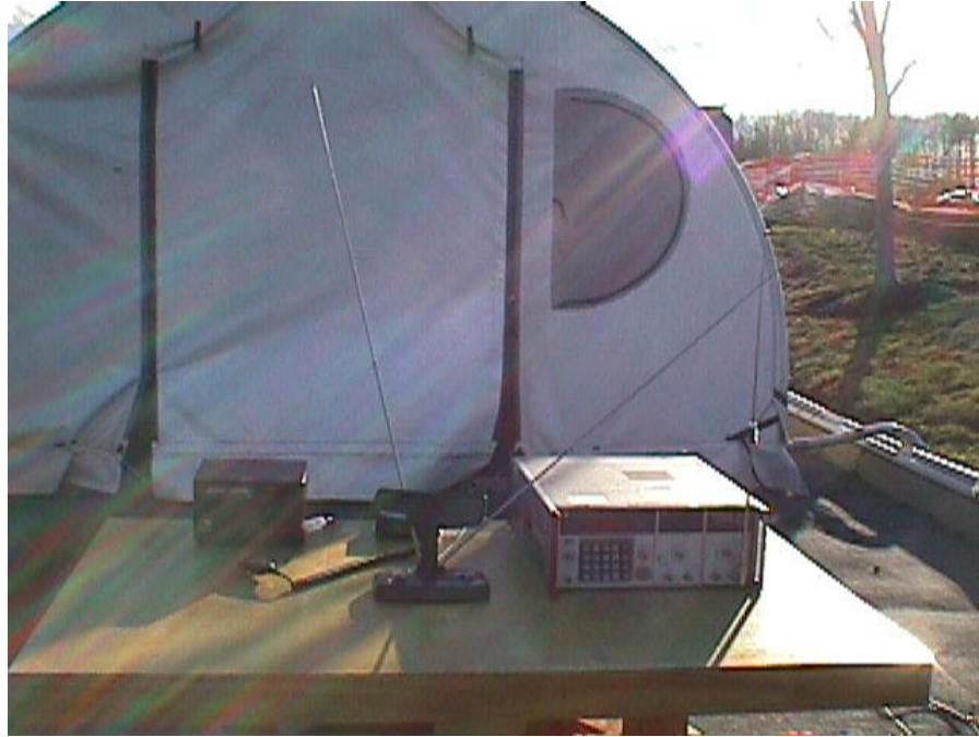
FRONT VIEW OF RADIATED EMISSIONS TEST

Company Name: Alinco, Inc. EUT: DR-605T FCC ID: EUGDR-605T Client Reference Number: DR-605T Work Order Number: 990529