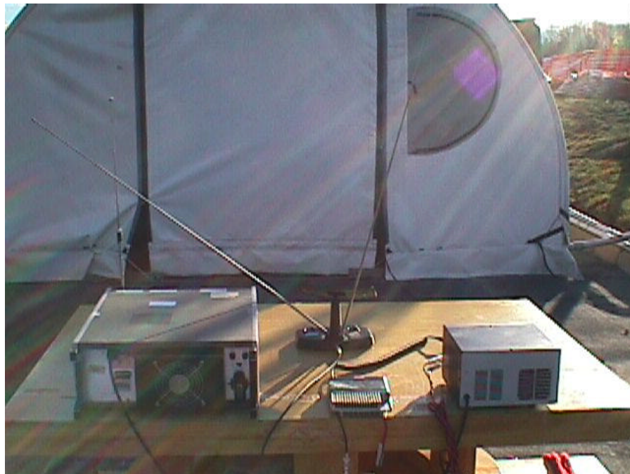
REAR VIEW OF RADIATED EMISSIONS TEST