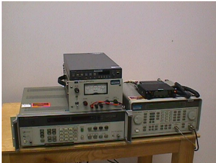
38dB REJECTION TEST