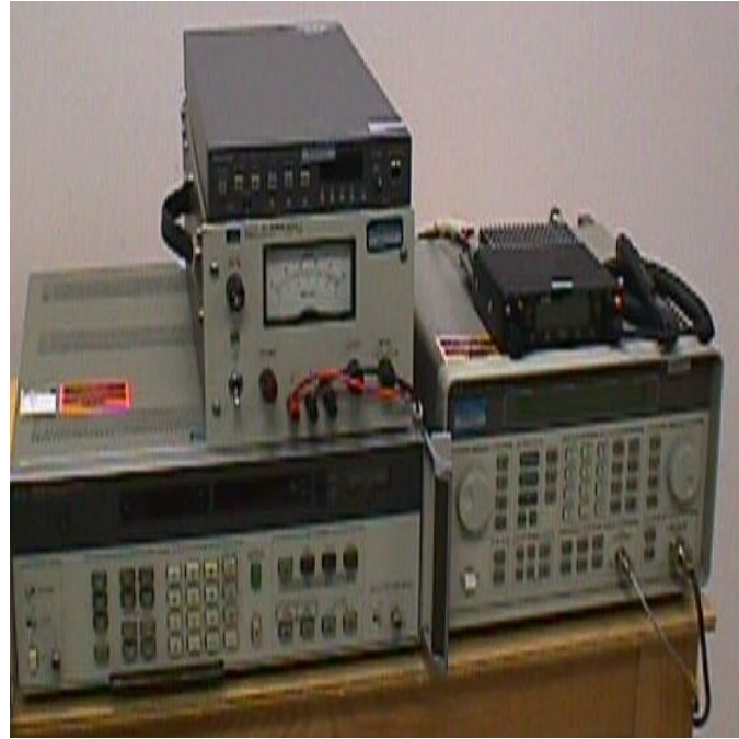
38dB REJECTION TEST

Company Name: Alinco, Inc. EUT: DR-605T FCC ID: EUGDR-605T Client Reference Number DR-605T Work Order Number: 990529