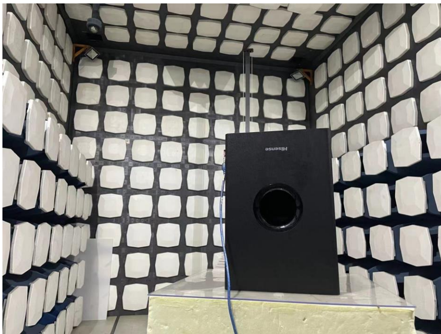
Back View (Above 1GHz)