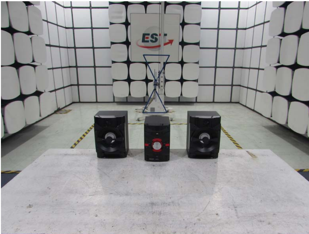
Radiated Test (1000-25000 MHz)