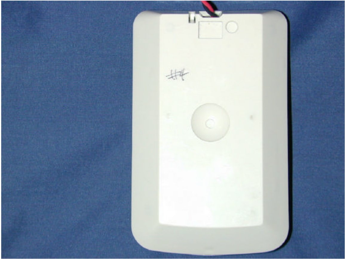
External View, Rear