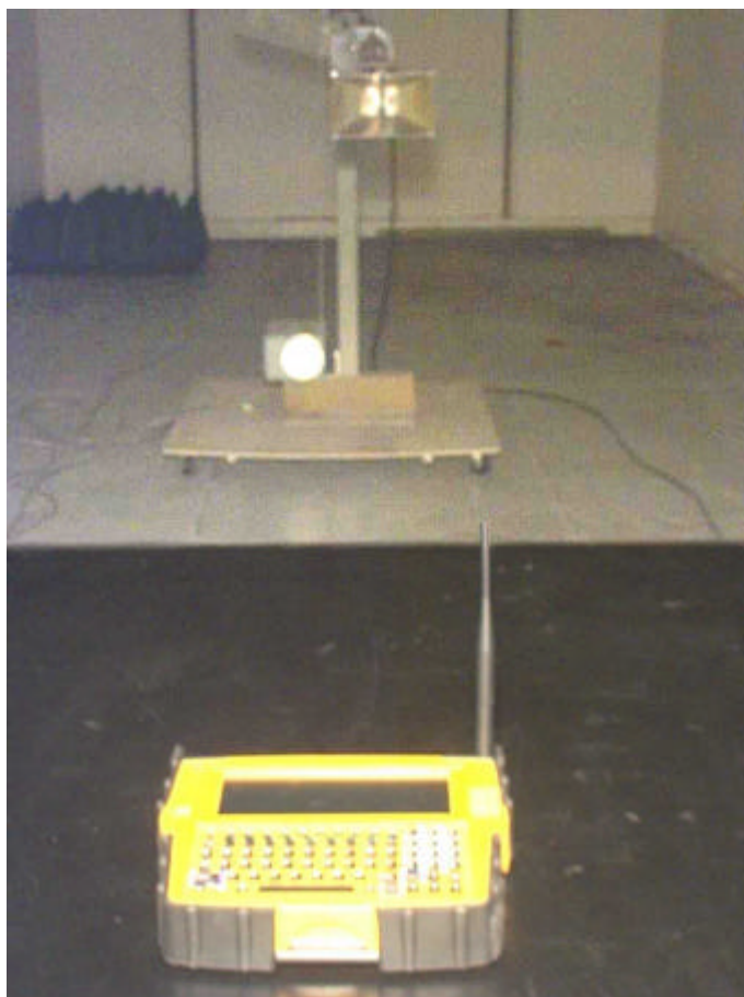
Sidearm ALL-Terrain Handheld PC™ Tested for Spurious Emissions at the OATS