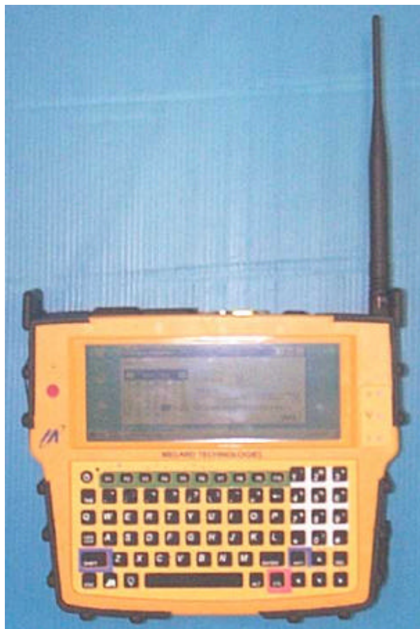
Melard Sidearm ALL-Terrain Handheld PC™ With the RIM R802D-2-0 Ardis