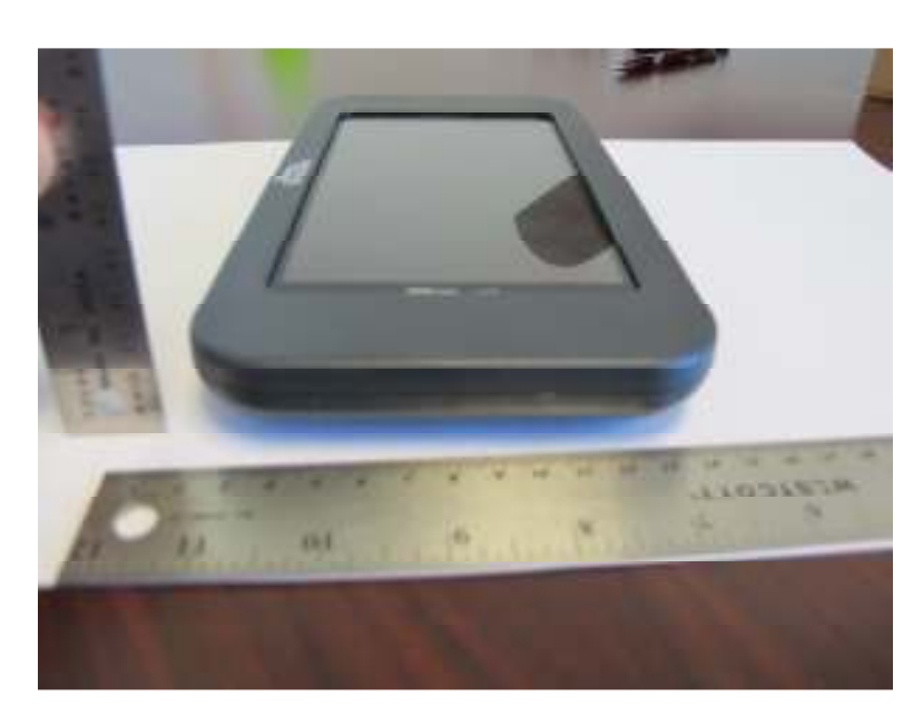
Figure 5 Model 3200 Programmer - Top View