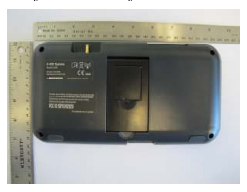
Figure 2 Model 3200 Programmer - Back View (for reference only)

Note: The labels shown are prototypes only. Label information is shown in the ID Label and Location Exhibit.