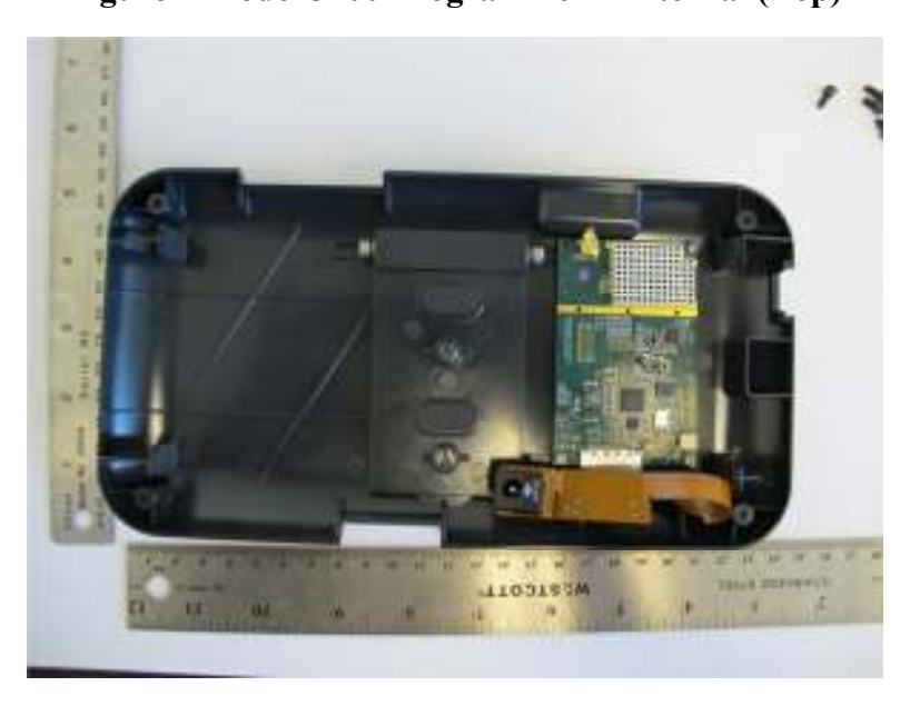
Figure 8 Model 3200 Programmer – Internal (Bottom)