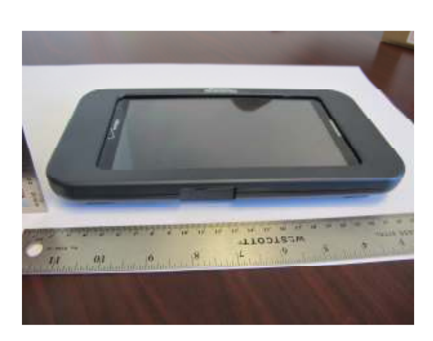
Figure 3 Model 3200 Programmer - Left View