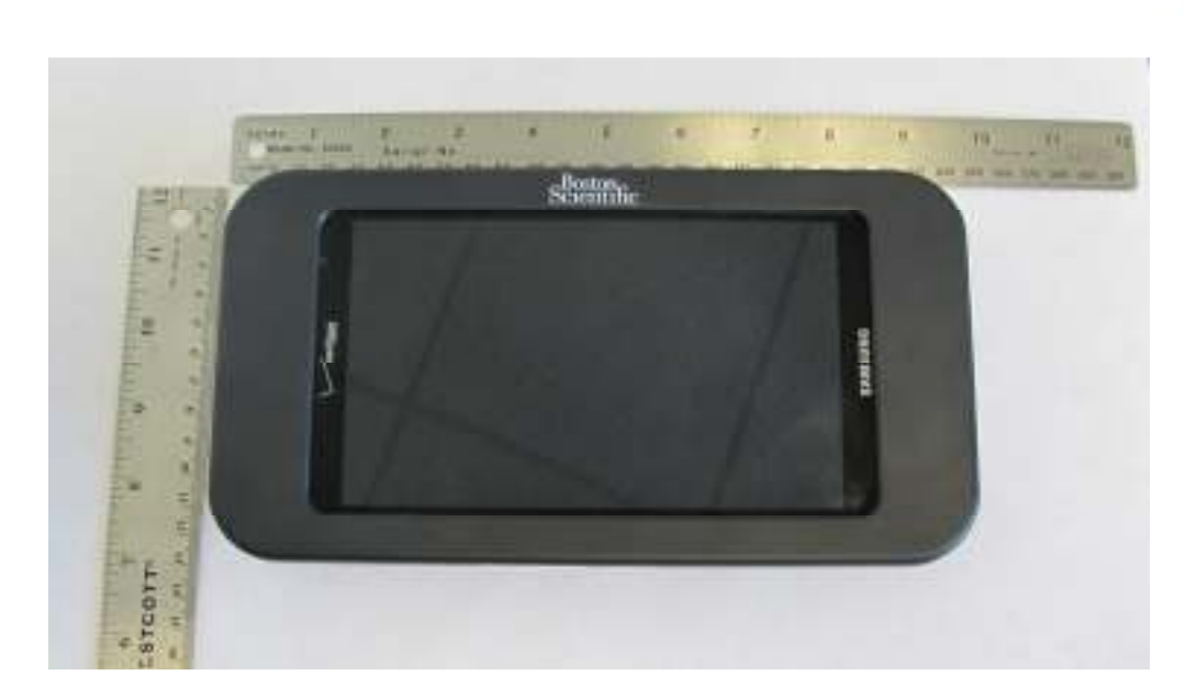
Figure 1 Model 3200 Programmer - Front View