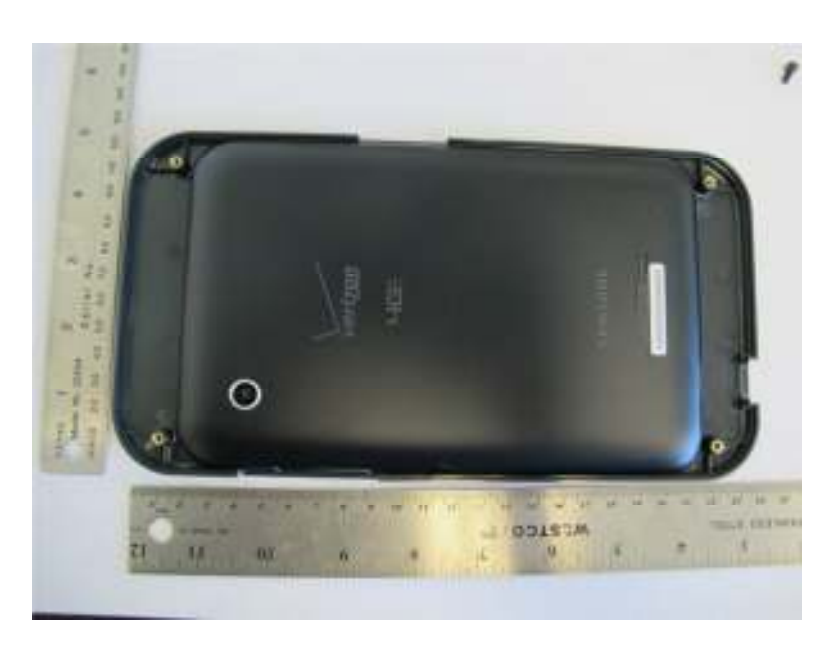
Figure 7 Model 3200 Programmer – Internal (Top)