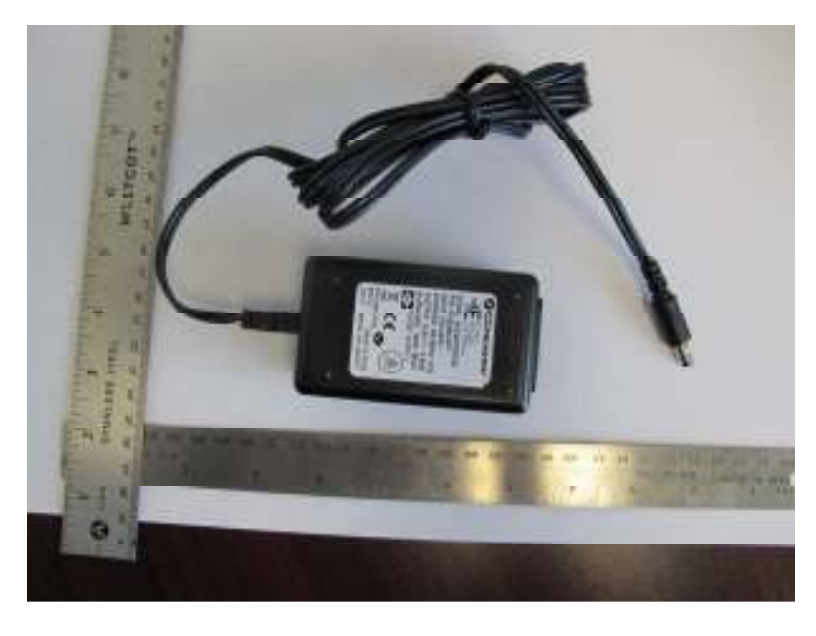
Figure 10 Model 3200 Programmer – Power Adapter (bottom)