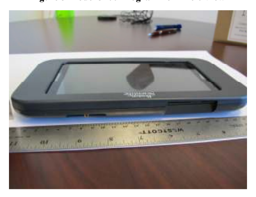
Figure 4 Model 3200 Programmer - Right View