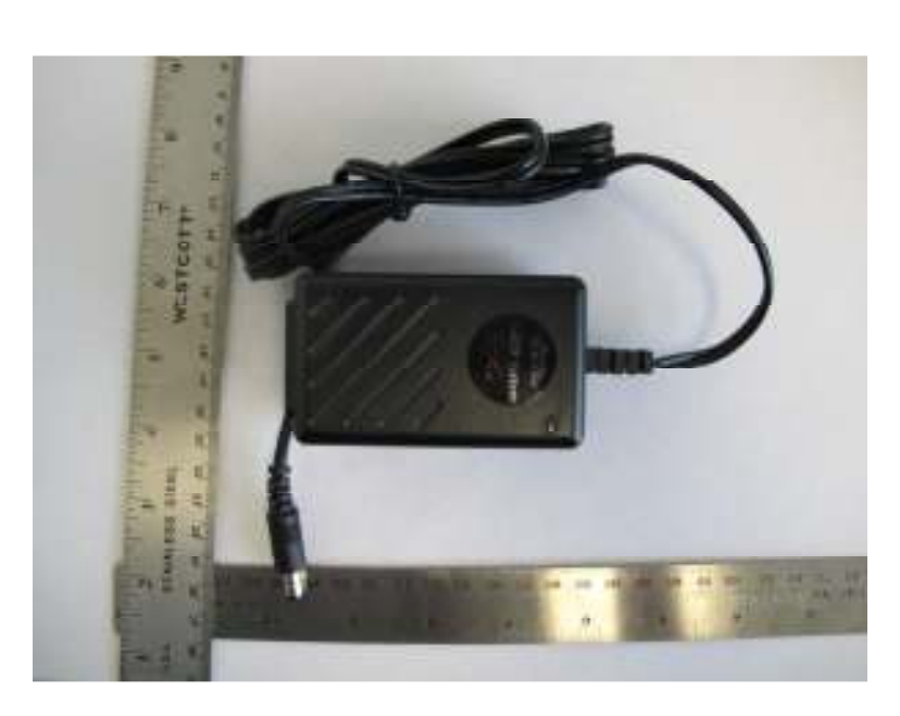
Figure 9 Model 3200 Programmer – Power Adapter (top)