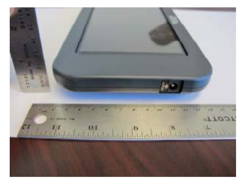
Figure 6 Model 3200 Programmer - Bottom View