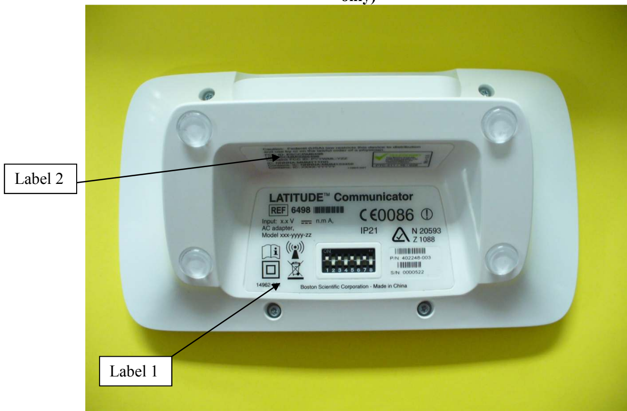
Figure 1. BSC Model 6498 Communicator Label Located on Bottom Housing (for reference only)

Note: The label information shown in this figure is for reference only.