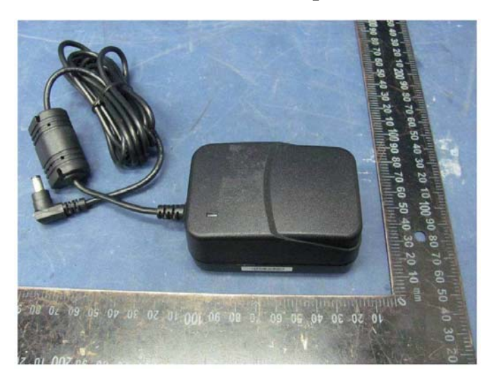
Figure 8. BSC Model 6299 Power Adapter (for reference only)