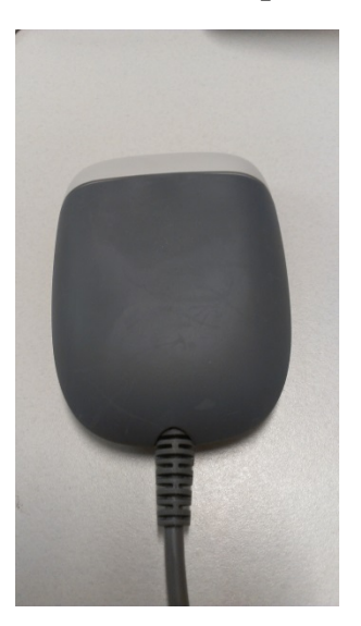
Figure 7. BSC Model 6299 – Wand Top View (for reference only)