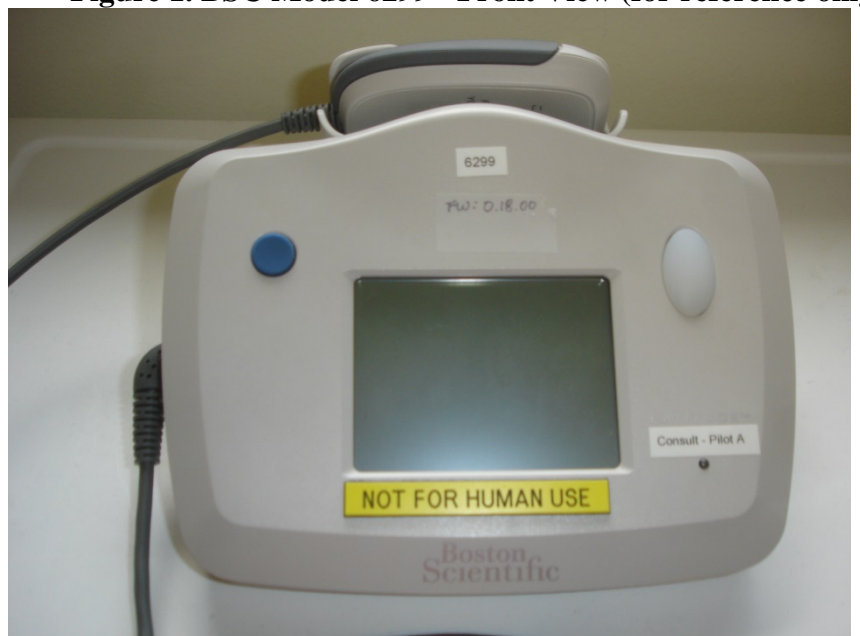
Figure 1. BSC Model 6299 - Front View (for reference only)

The following are external photos of the Model 6299.