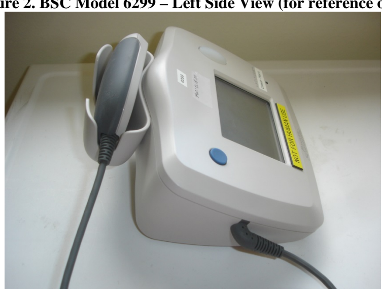
Figure 2. BSC Model 6299 – Left Side View (for reference only)