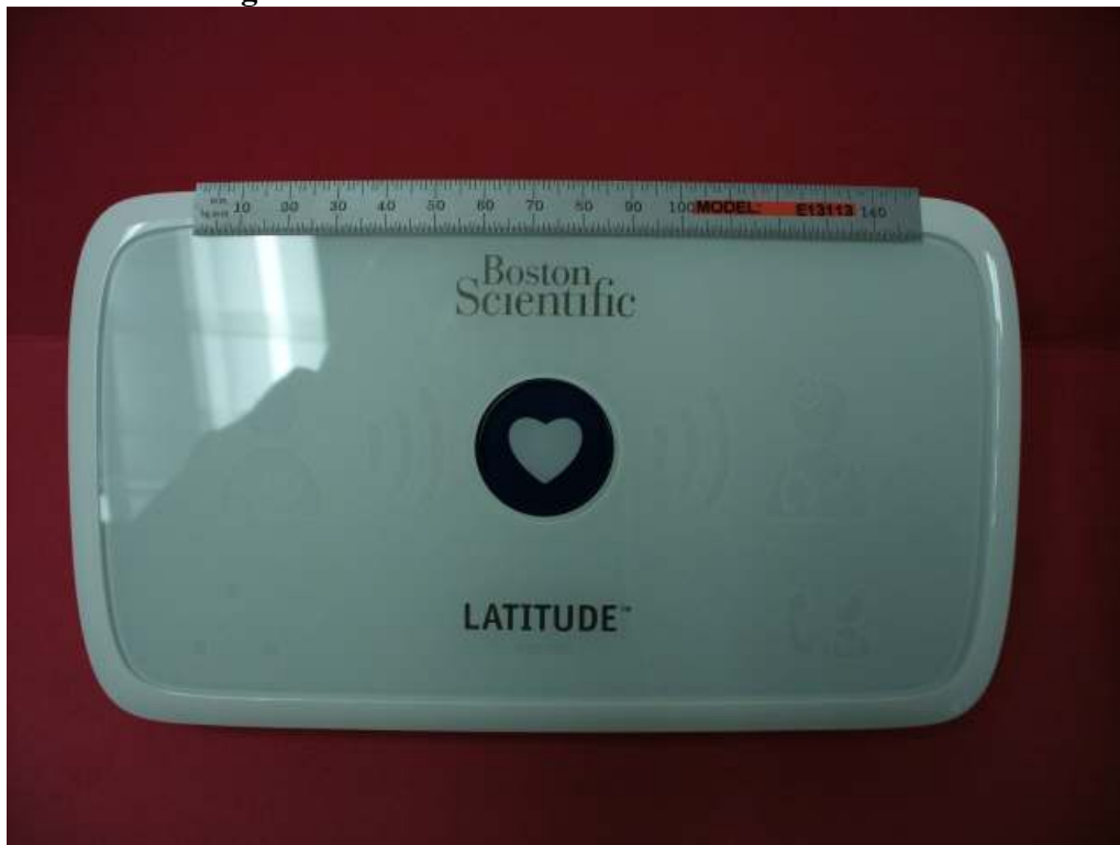
Figure 1 BSC Model 6290 Communicator - Front View

The following are external photos of the Model 6290 LATITUDE™ Communicator.