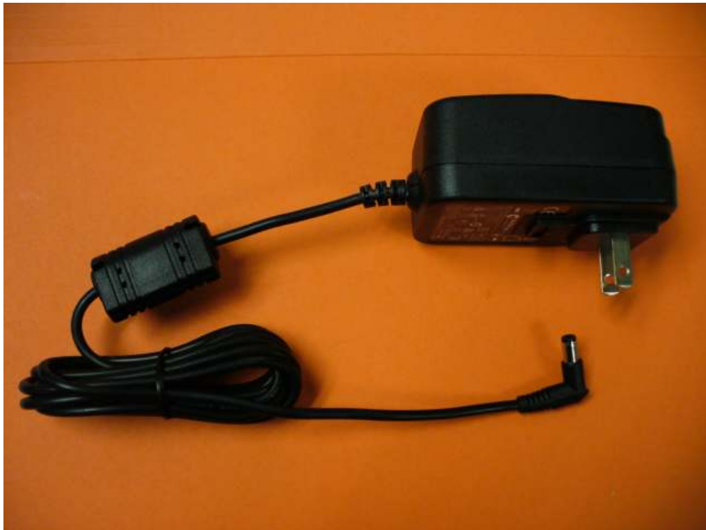
Figure 6 BSC Model 6290 Communicator – Power Adapter