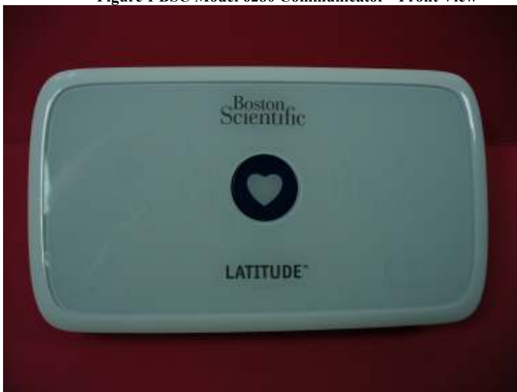
Figure 1 BSC Model 6280 Communicator - Front View

The following are external photos of the Model 6280 LATITUDE™ Communicator.