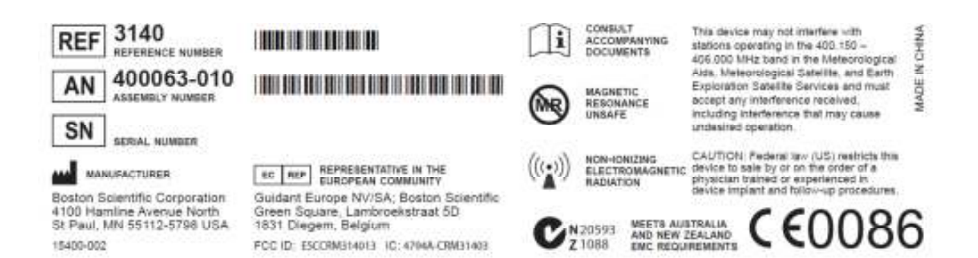
Figure 2. BSC Model 3140 Zoom Wireless Transmitter Label