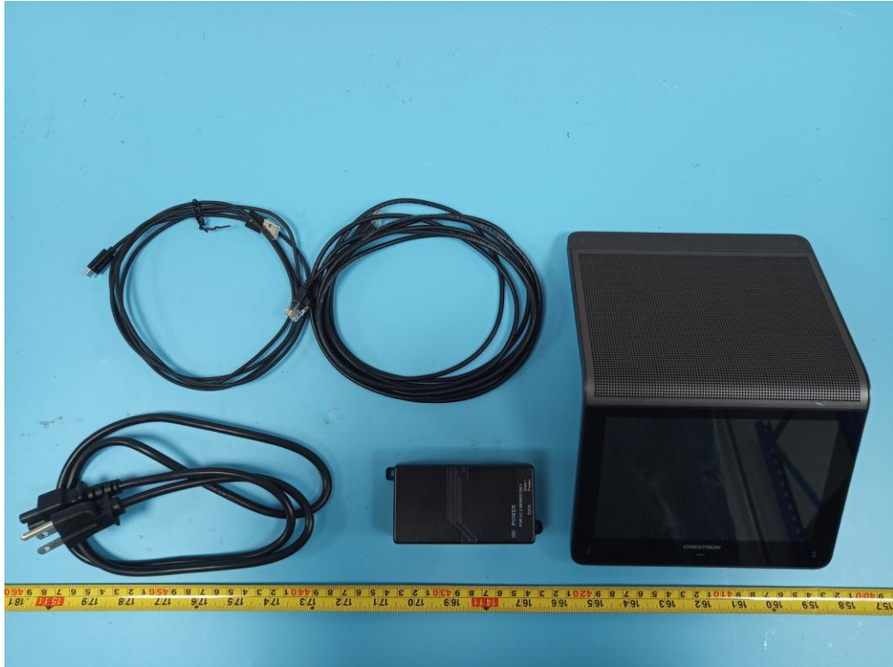
EXHIBIT B - EUT EXTERNAL PHOTOGRAPHS