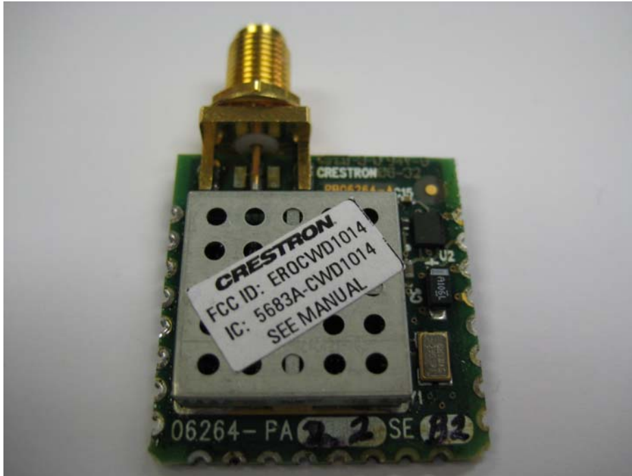
View #1 of Module, Shielded, Showing FCC ID Label