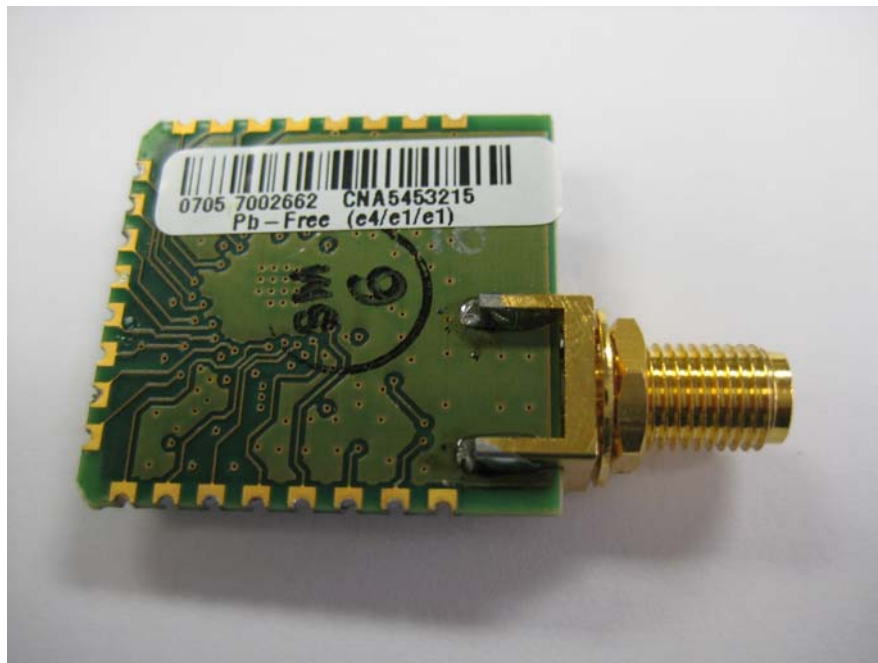
View #2 of Backside of RF Section