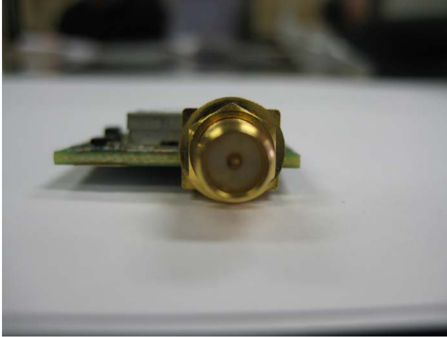
View #1 of Pin on Antenna Connection