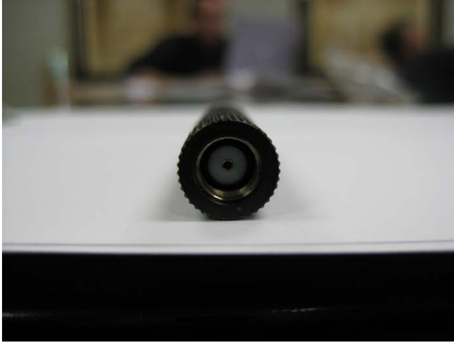
View #1 of Pin on Antenna