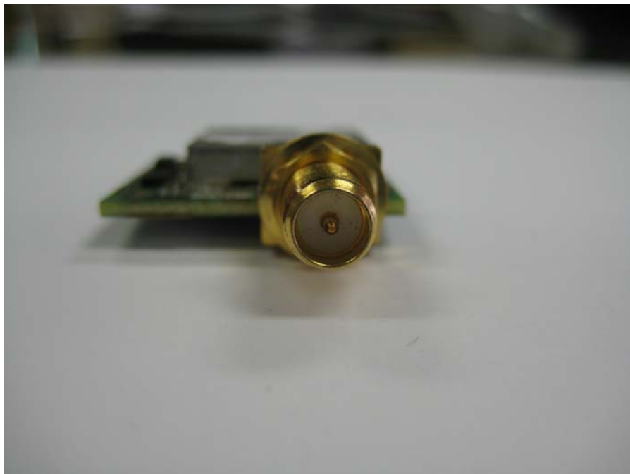
View #2 of Pin on Antenna Connection