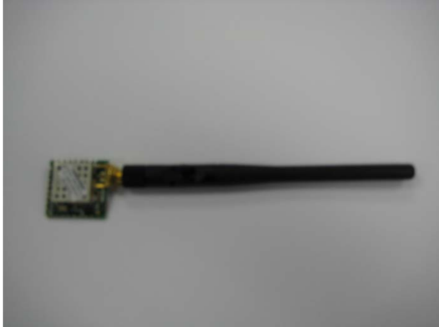
View of Module, with Antenna Connected