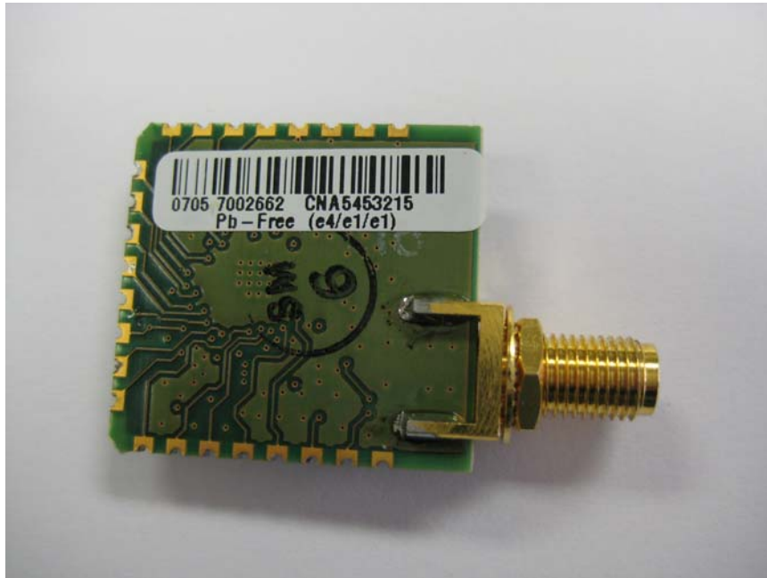
View #1 of Backside of RF Section