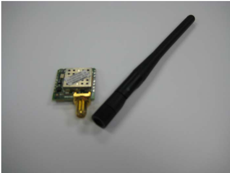
View of Module, with Antenna not connected