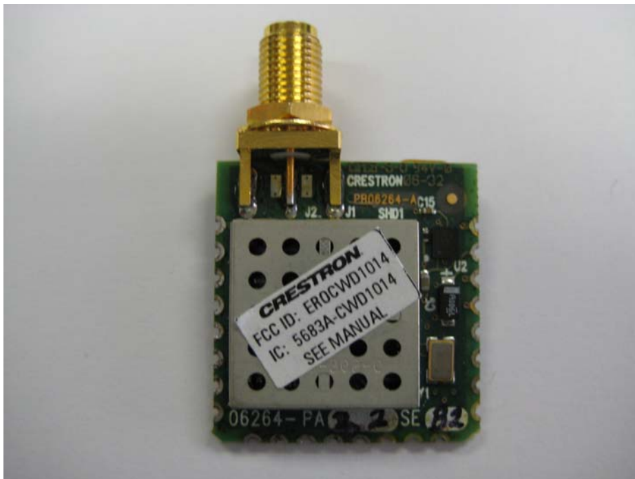
View #2 of Module, Shielded, Showing FCC ID Label