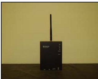
Dipole Antenna (Straight)