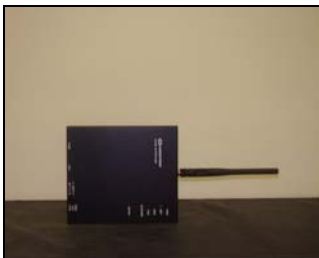
Dipole Antenna (Straight)