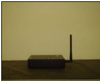
Dipole Antenna (90°)