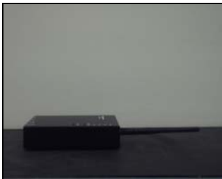
Dipole Antenna (Straight)