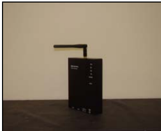
Dipole Antenna (90°)