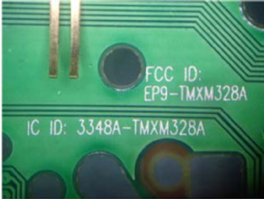
Figure 1: Label Art silk-screened on the watch circuit board.