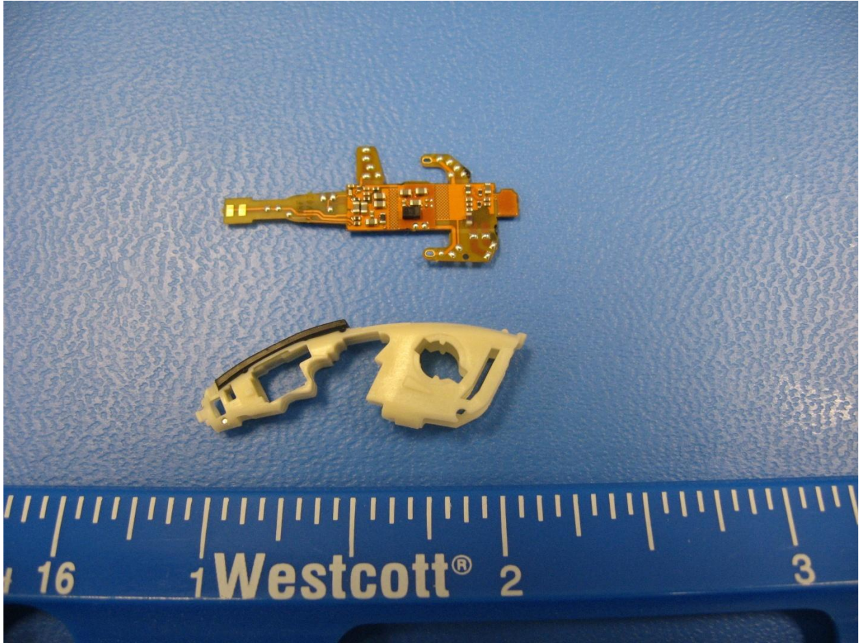
IRIS hearing aid internal construction showing bottomside flex circuit and mounting frame. Antenna not shown