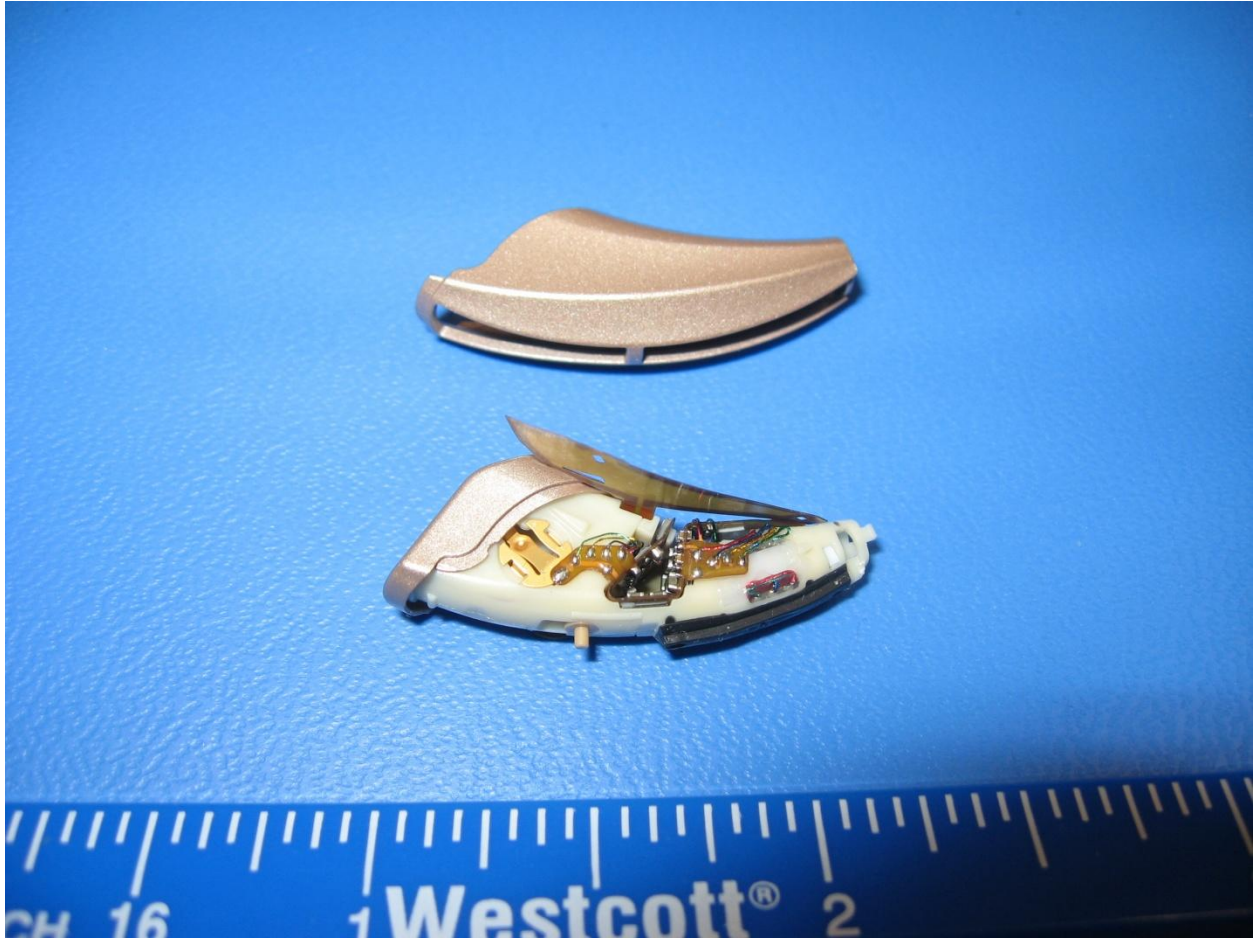
IRIS Hearing Aid with case cover removed and foil antenna bend up to reveal circuitry