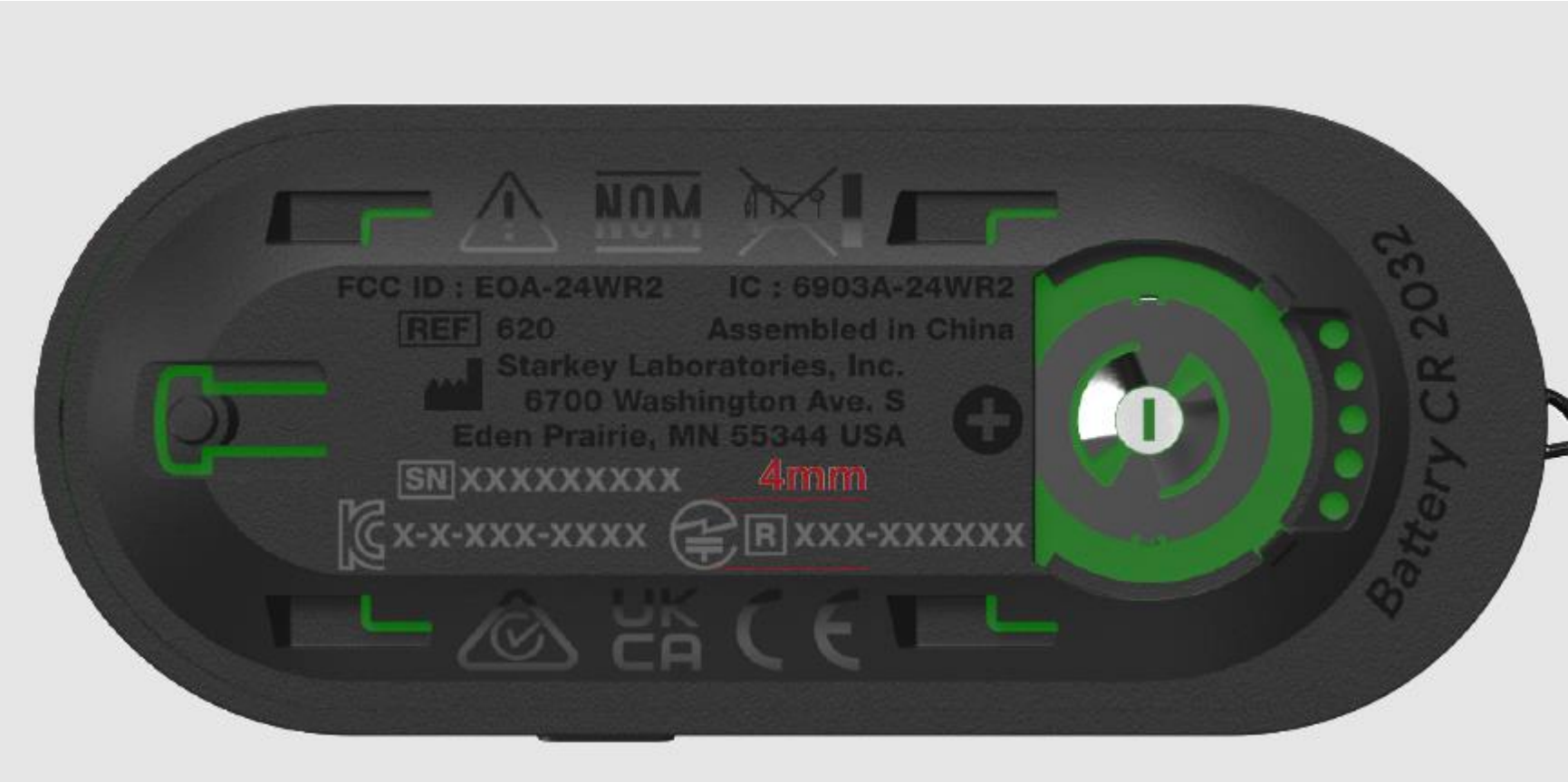
This shows the back of the remote control with the outside cover removed showing the placement of the regulatory markings