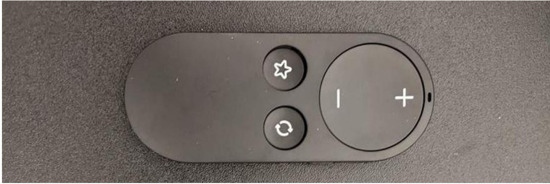
Figure 3 Front of Case