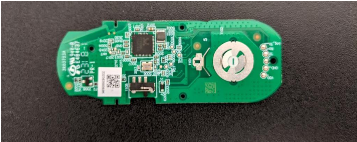
Figure 9 PC Board bottom side, showing battery contact, antenna in upper left corner of board, and antenna matching network