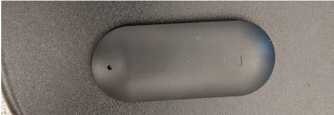
Figure 5 Outside of Back Cover

The back cover covers the assembly shown in Figure 1