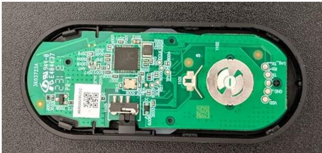
Figure 2 PC board placed in front case with cover removed

Figure 1 shows items 1, 2, and 3 (above) assembled into the remote, with battery installed.