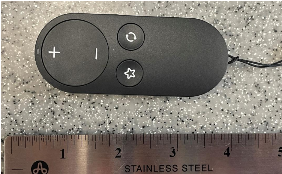
Figure 7 Front of Remote showing scale in inches