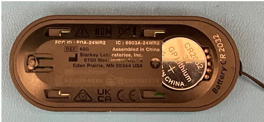
Figure 1 Battery Holder with Regulatory Label

The user can remove the back cover to replace the battery, however the other 3 pieces cannot be disassembled without destroying the unit.