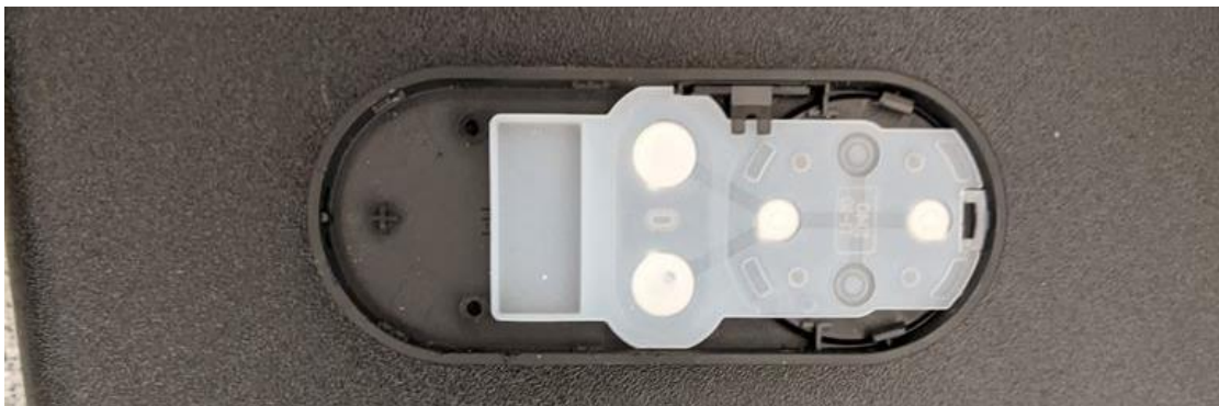
Figure 4 Inside of Front of Case