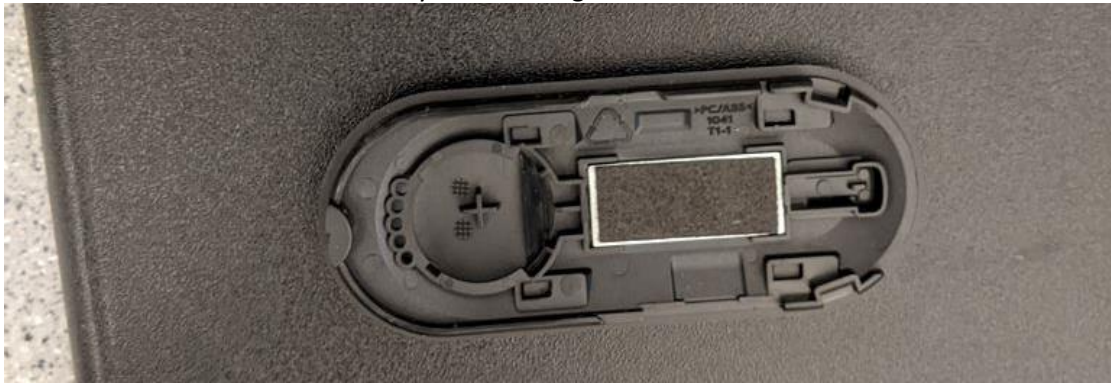
Figure 6 Inside of Back Cover

The back cover covers the assembly shown in Figure 1