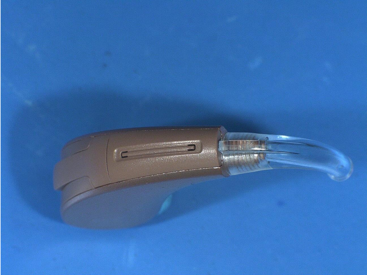
Ear hook end