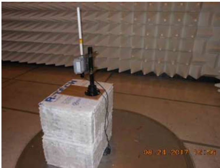
Below 1GHz, 5.5dBi Antenna