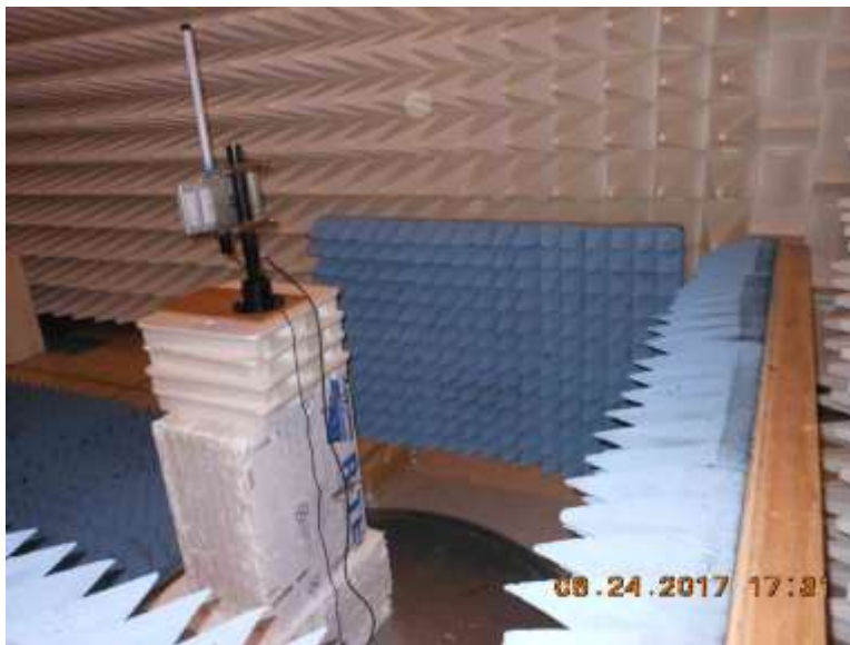
Above 1GHz, 5.15dBi Antenna, Cone Placement