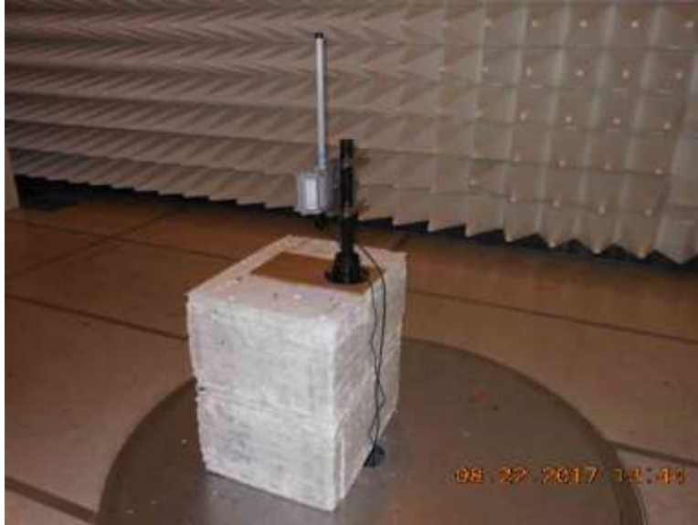
Below 1GHz, 5.15dBi Antenna