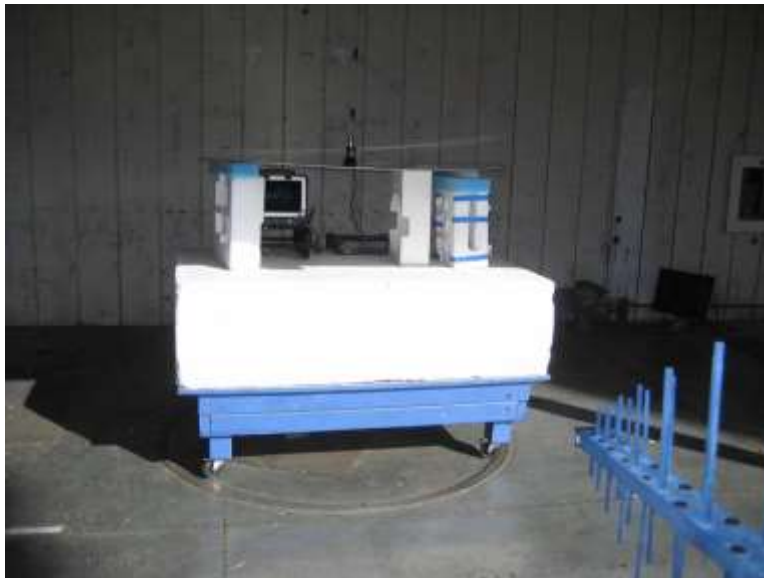
Configuration 2, Below 1GHz