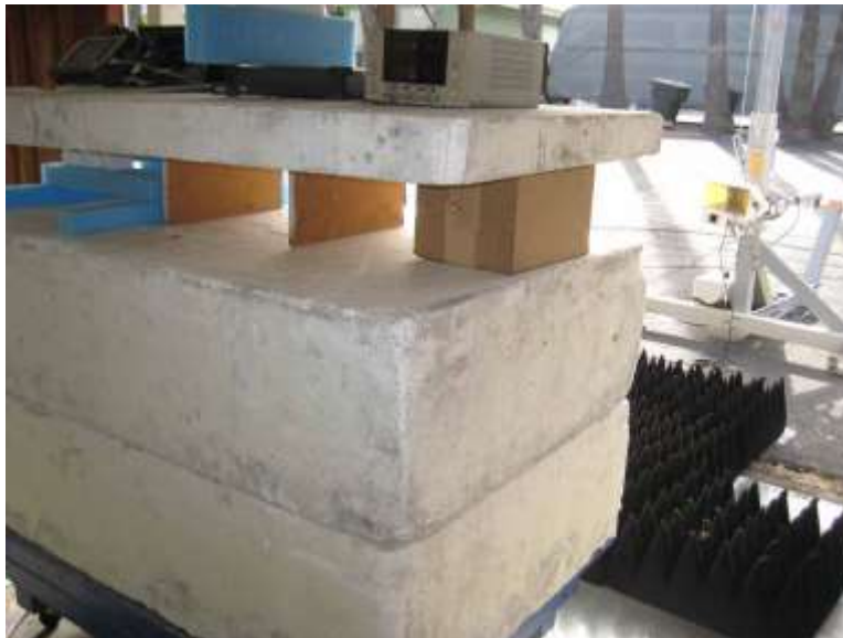
Configuration 1, Above 1GHz Cone placement