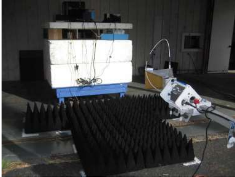
Configuration 1, Above 1GHz Cone placement