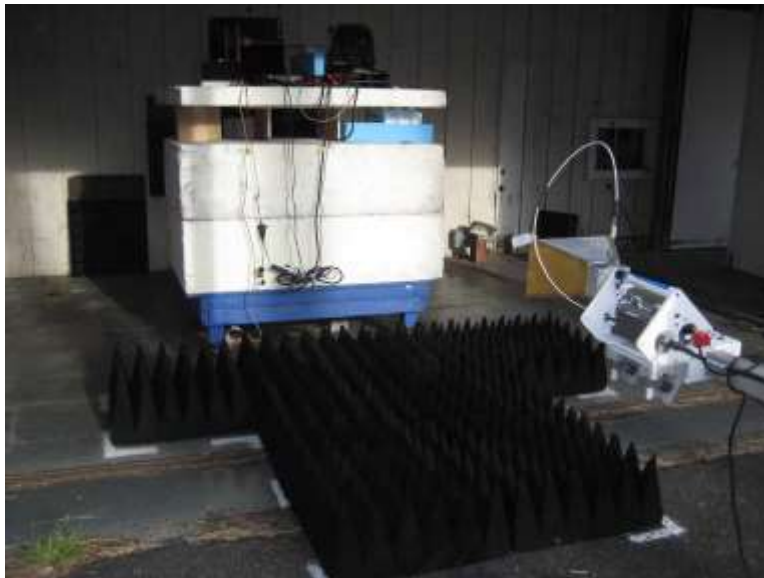
Configuration 2, Above 1GHz Cone placement