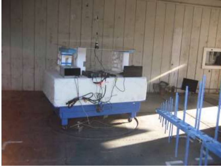
Configuration 1, Below 1GHz