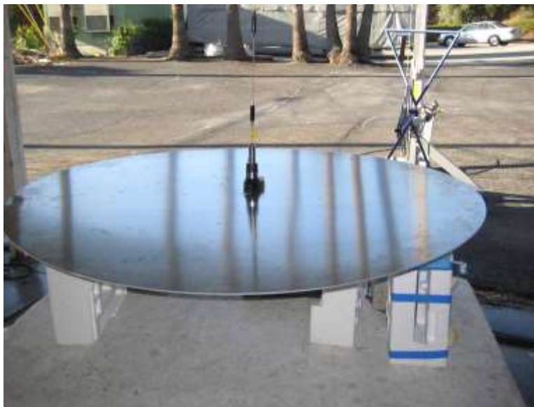
Configuration 1, Below 1GHz