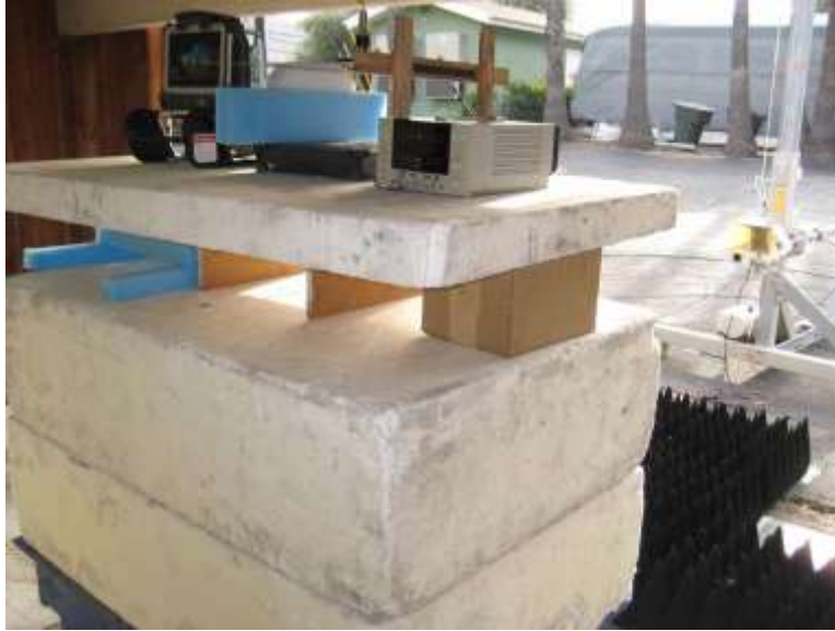
Configuration 2, Above 1GHz Cone placement