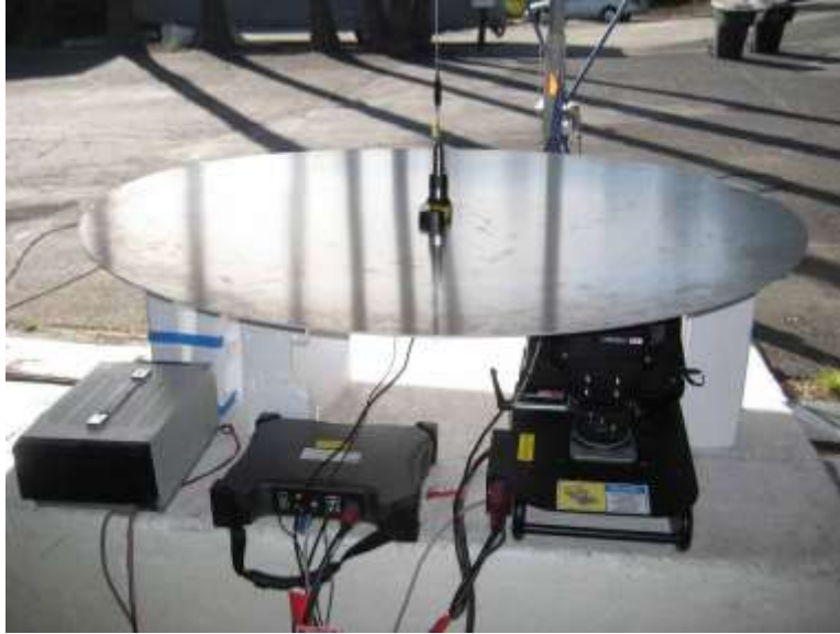
Configuration 2, Below 1GHz