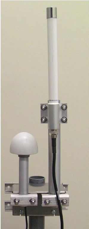
Remote GPS (left) and WAN (right) antennas.