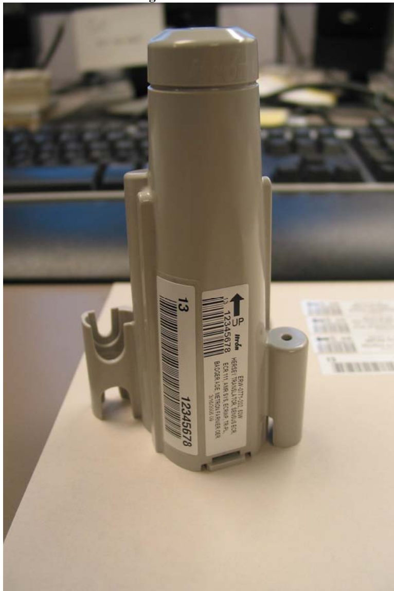
Figure 2 Unit upright