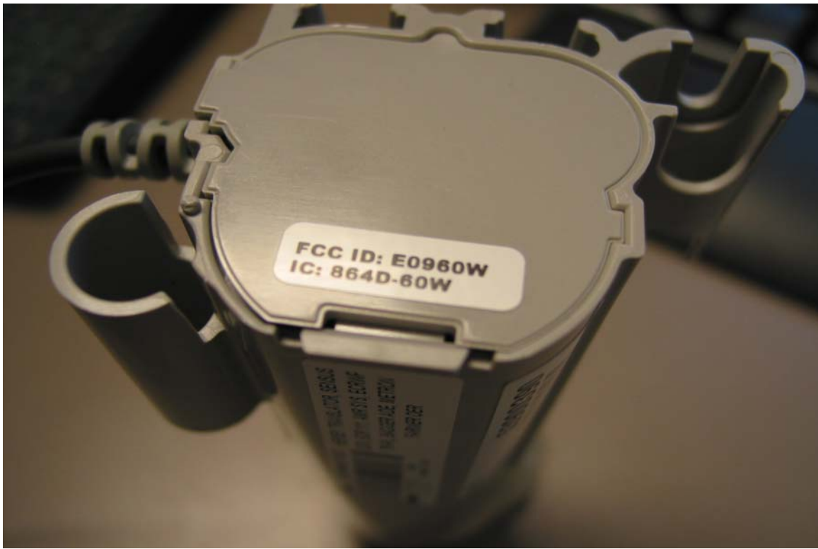
Figure 1 Unit Bottom