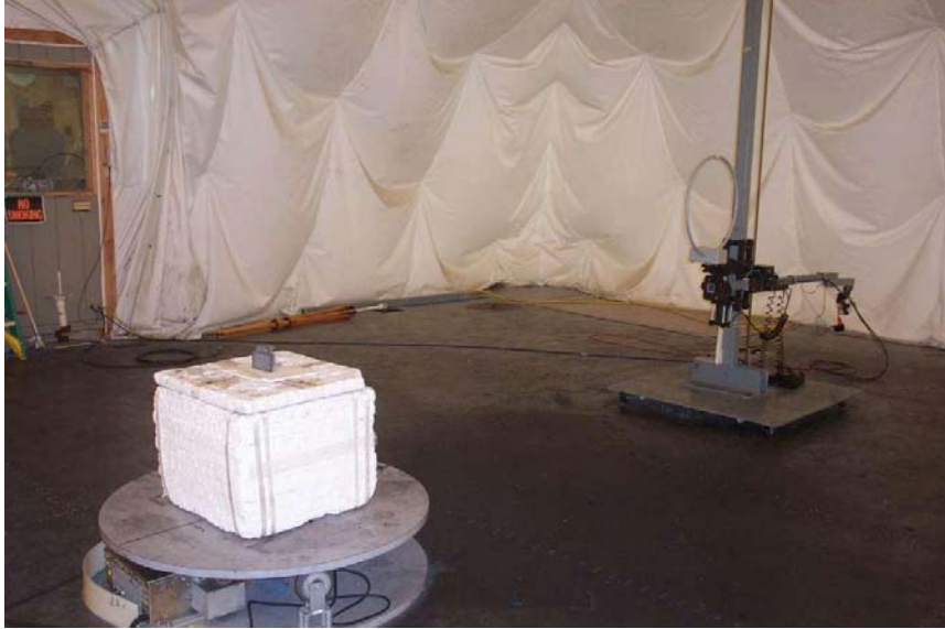
RX and TX Spurious 9kHz to 30MHz