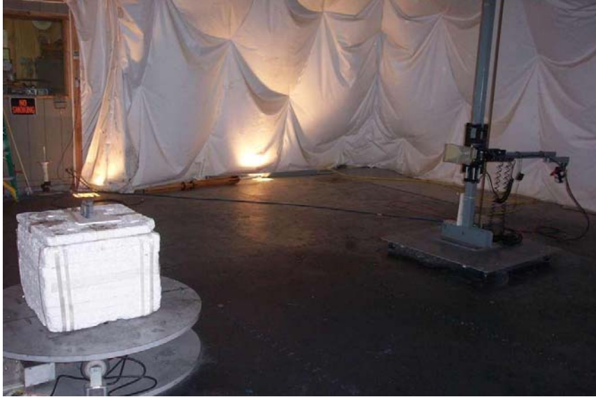
TX Fundamental Measurement without preamp