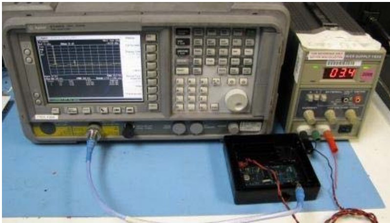
TX Conducted Spurious