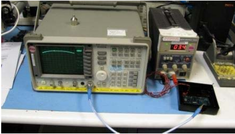
TX Conducted Power