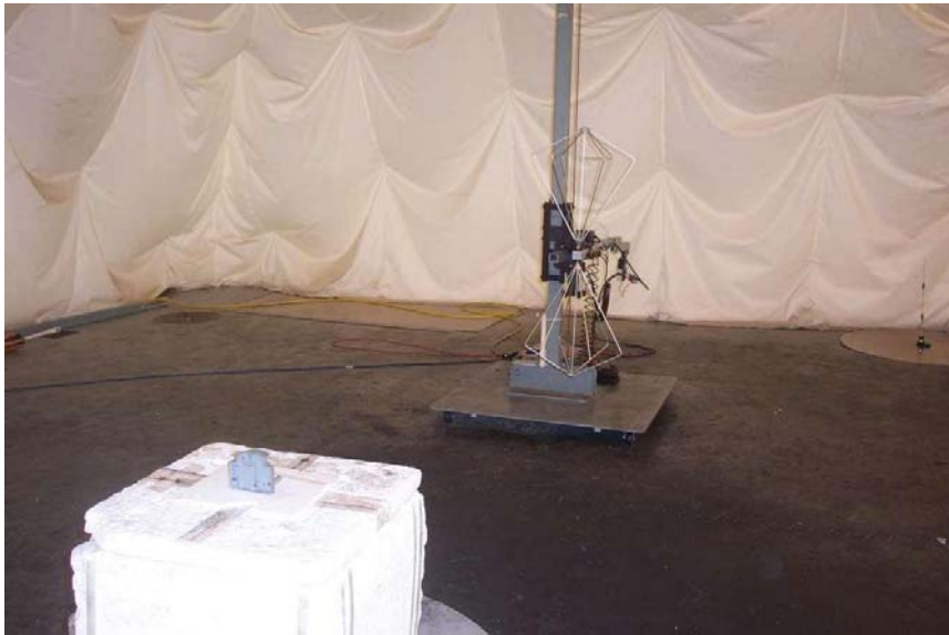
RX and TX Spurious 30MHz to 200MHz