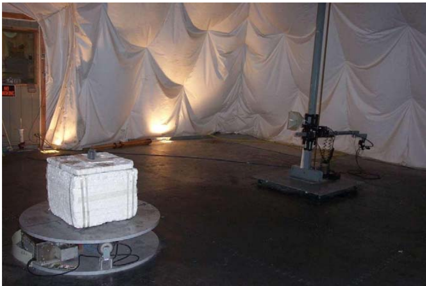
RX and TX Spurious above 1GHz