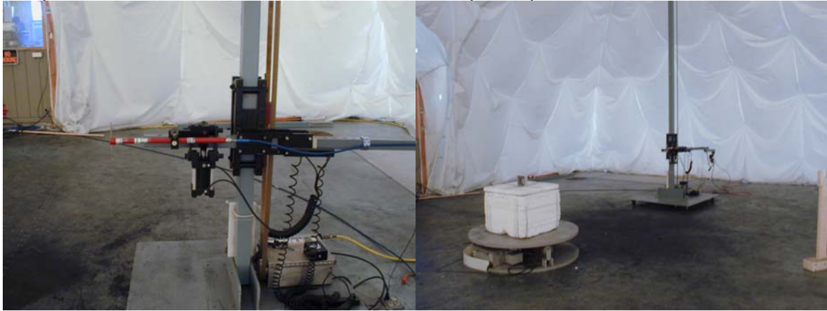
Setup for measuring the receiver radiated emissions