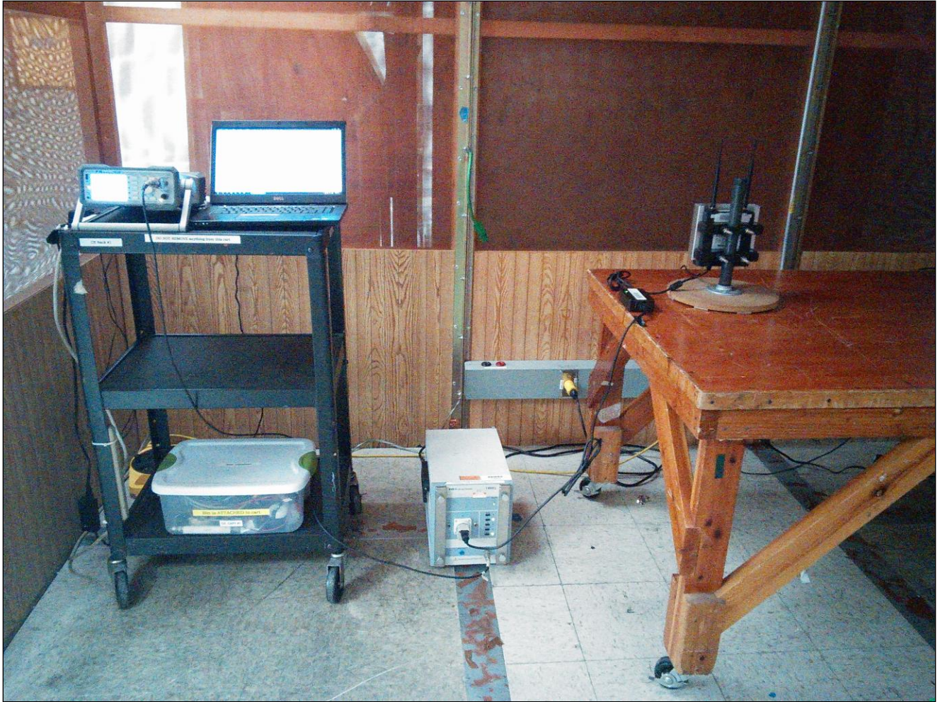
Photograph 1. Conducted Emissions, 15.207(a), Test Setup