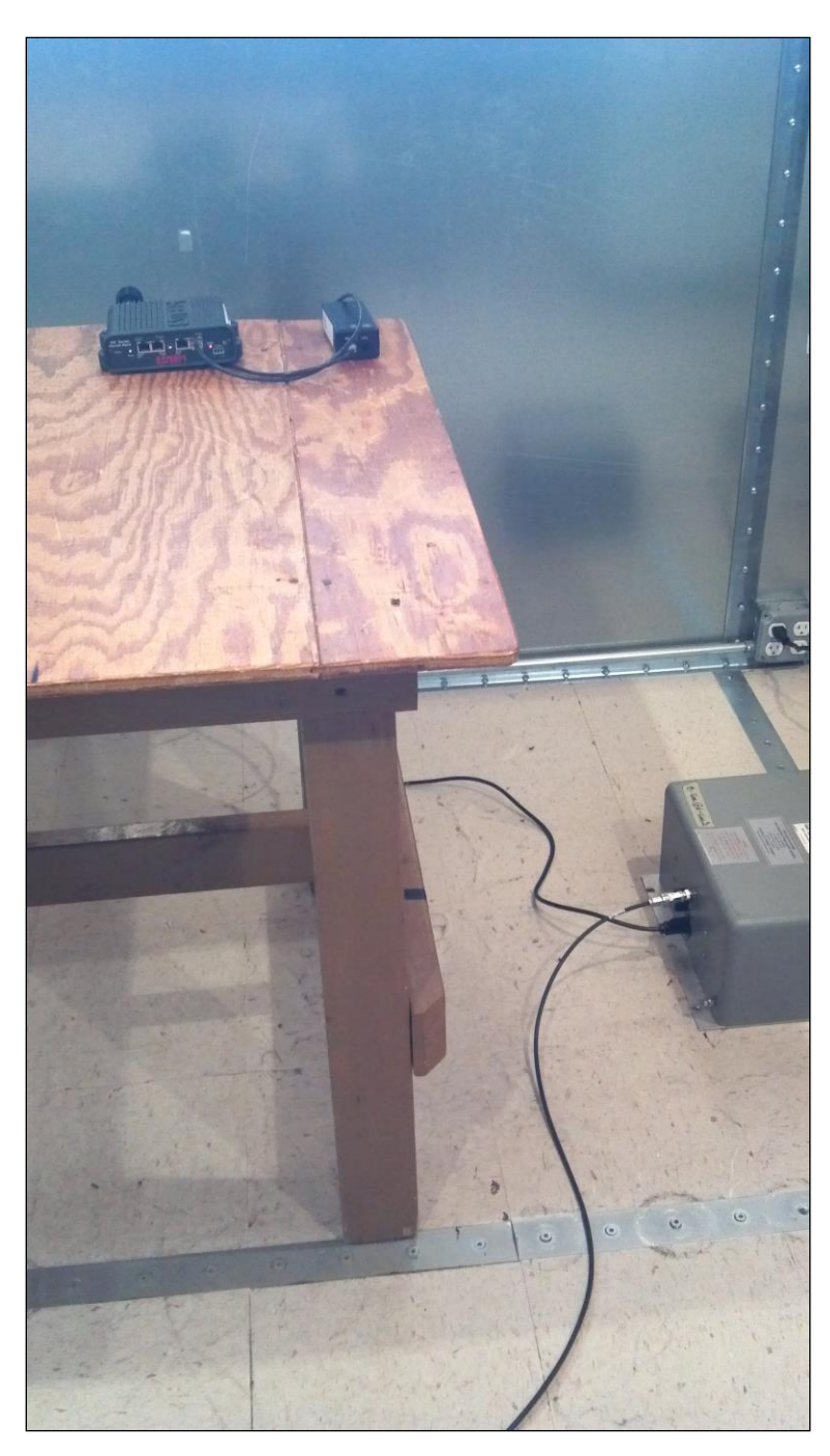
Photograph 1. Conducted Emissions, Test Setup