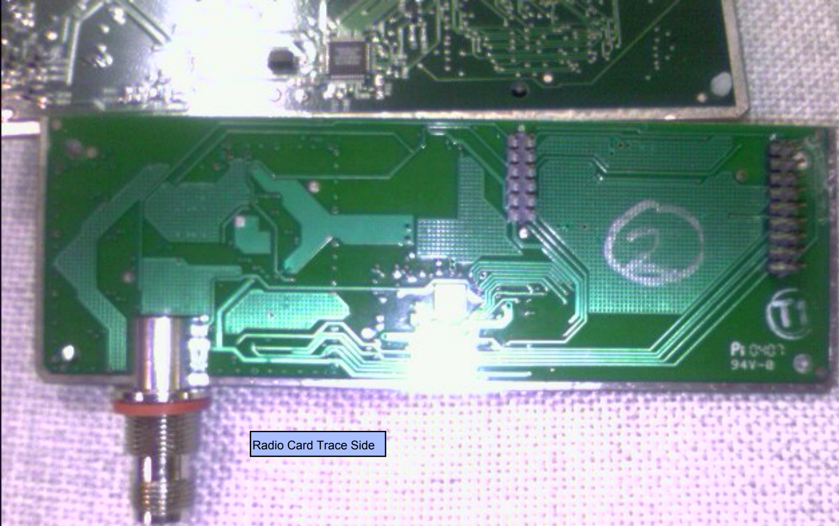
Radio Card Trace Side