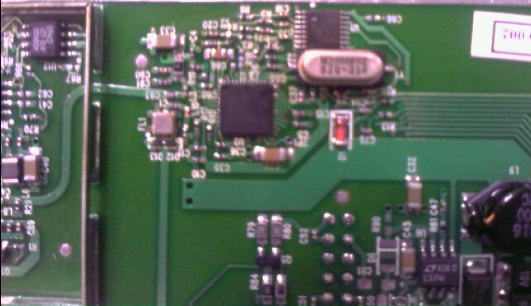
Radio Card Close Up