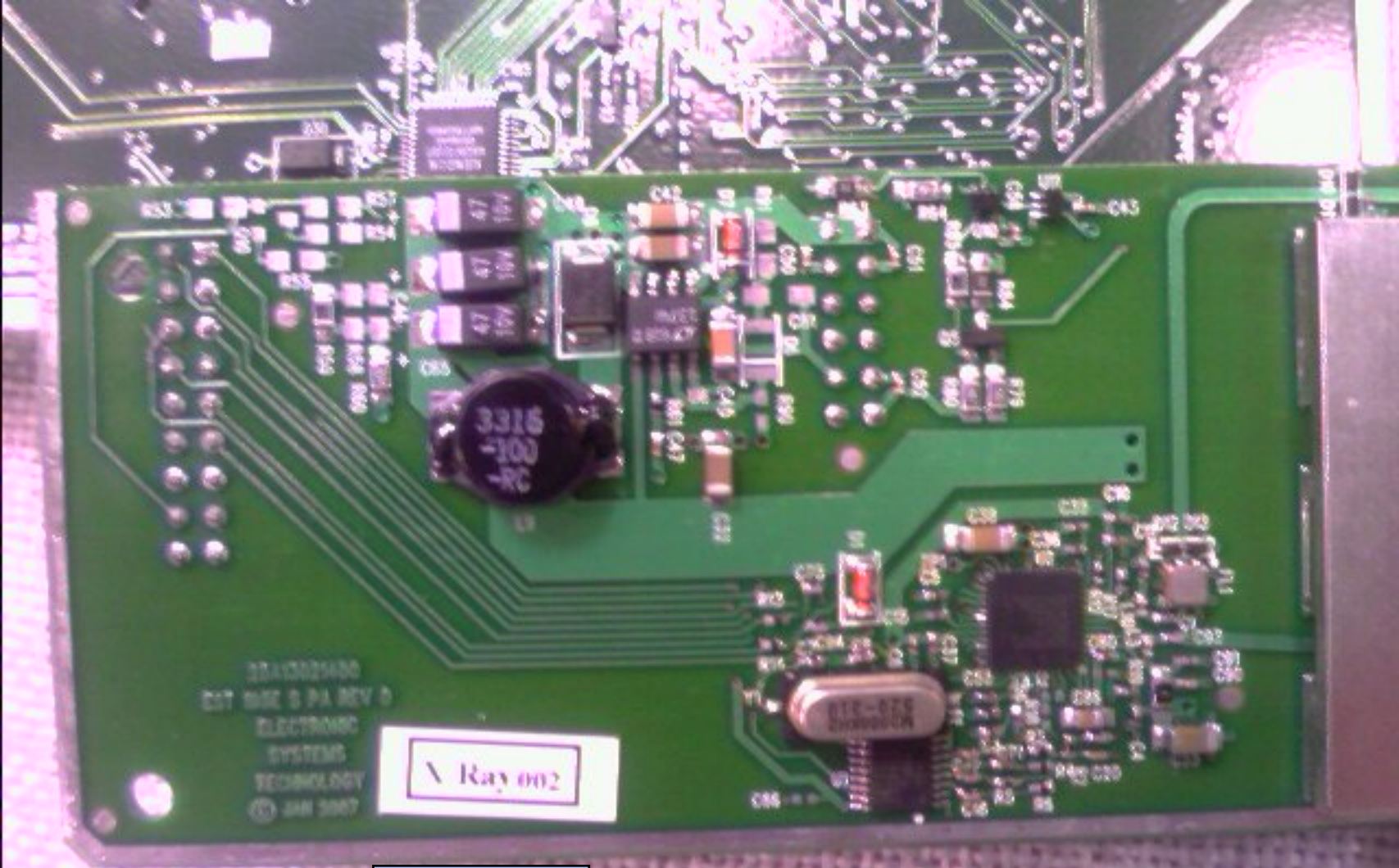
Radio Card Close Up