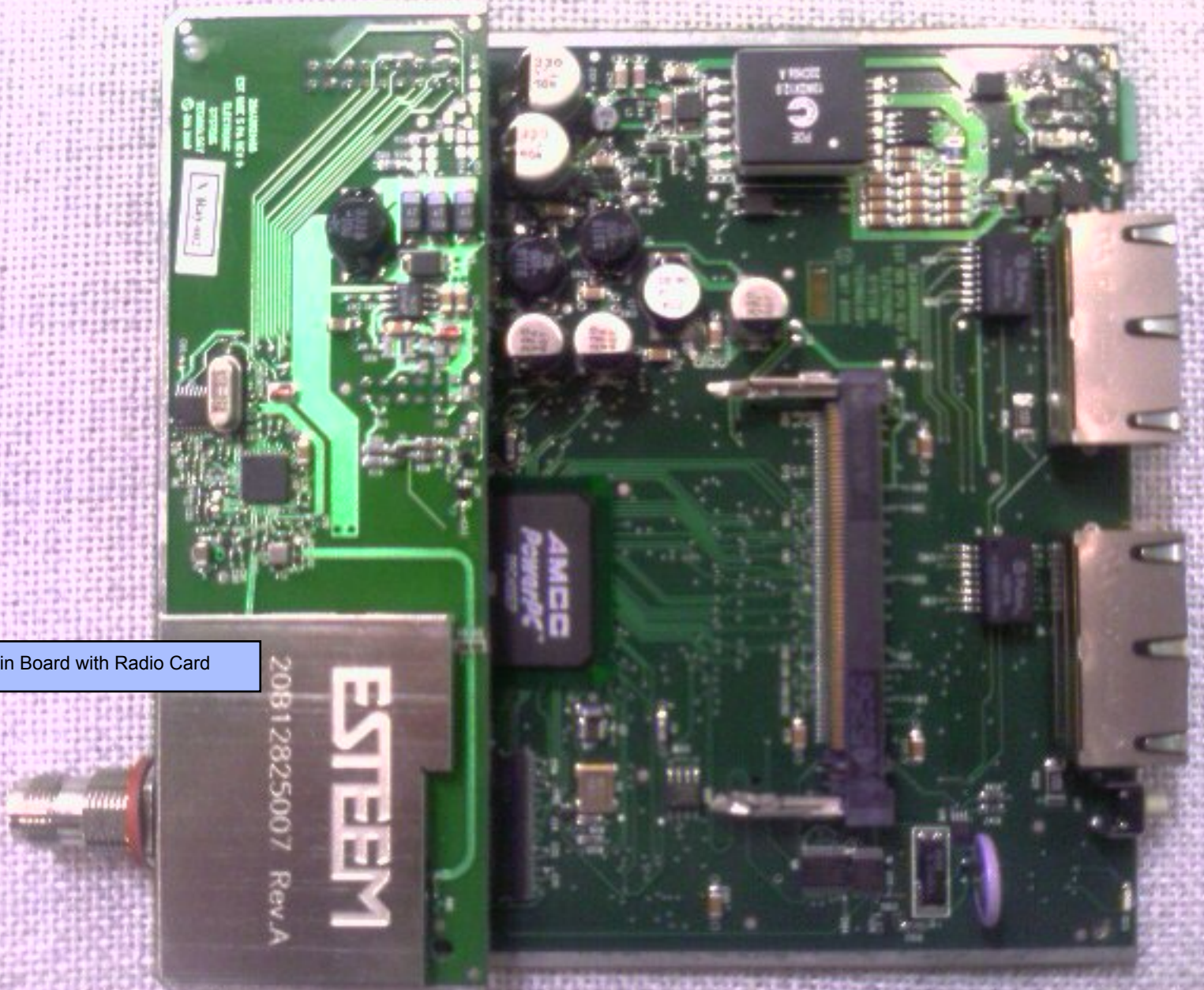
Main Board with Radio Card