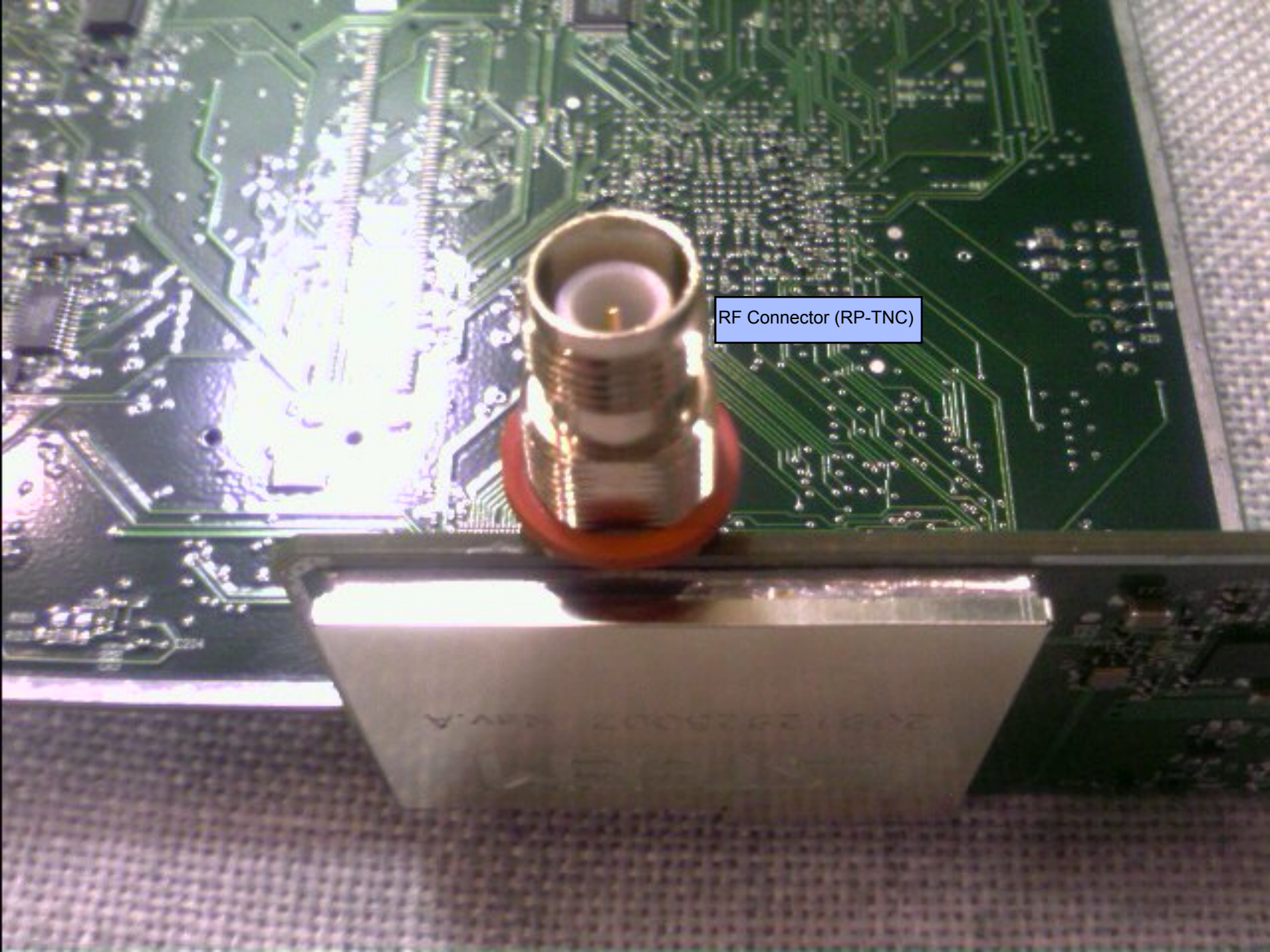
RF Connector (RP-TNC)