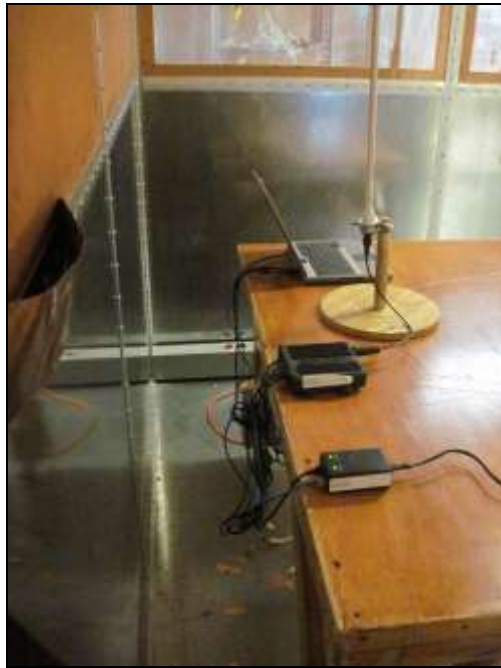
Photograph 10. Conducted Emissions, 15.207(a), Test Setup, POE (2)