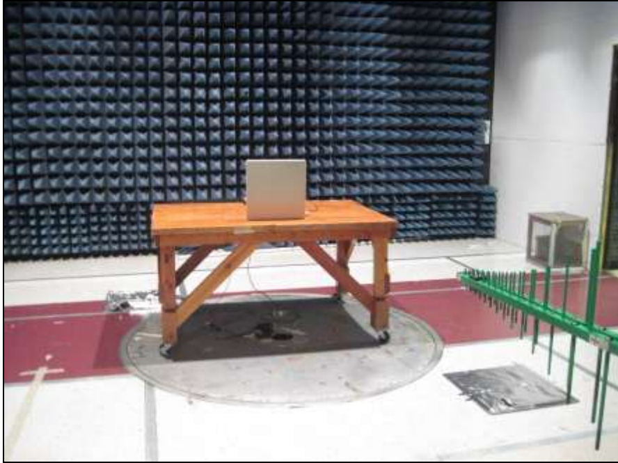
Photograph 13. Radiated Spurious Emissions, Test Setup, Panel Antenna, 30 MHz – 1 GHz