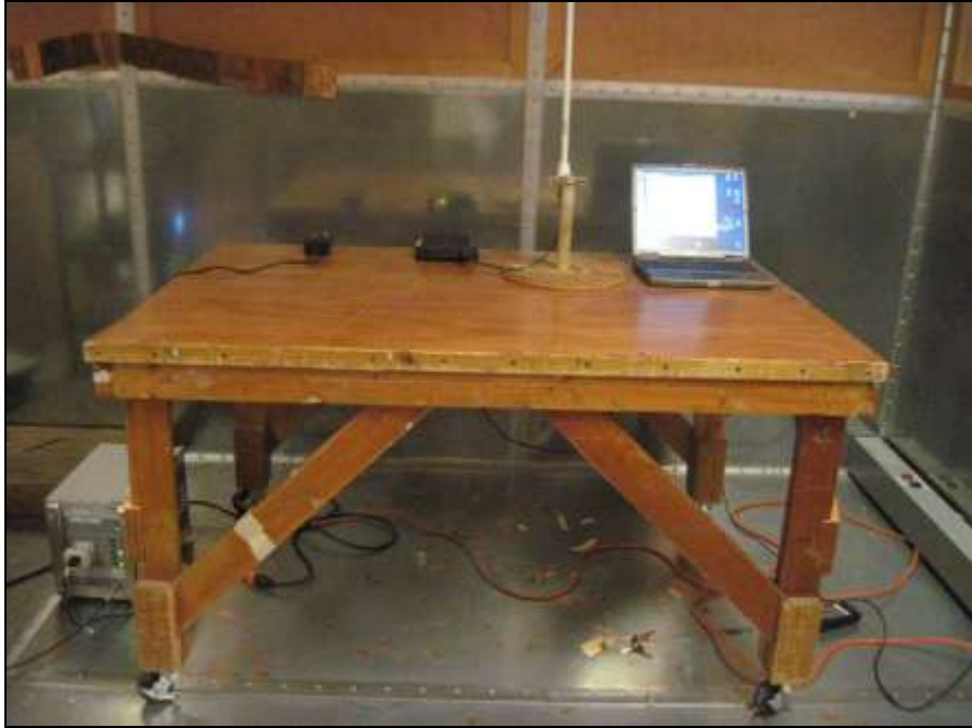
Photograph 9. Conducted Emissions, 15.207(a), Test Setup, POE (1)