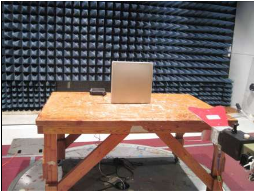
Photograph 14. Radiated Spurious Emissions, Test Setup, Panel Antenna, Above 1 GHz