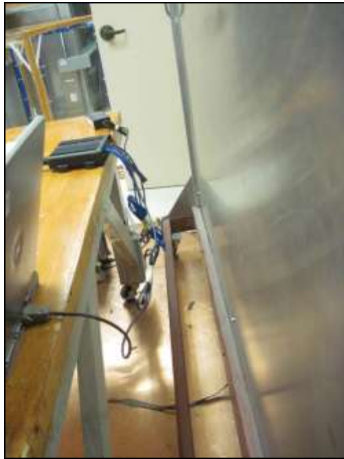
Photograph 8. Conducted Emissions, 15.207(a), Test Setup, AC/DC (2)