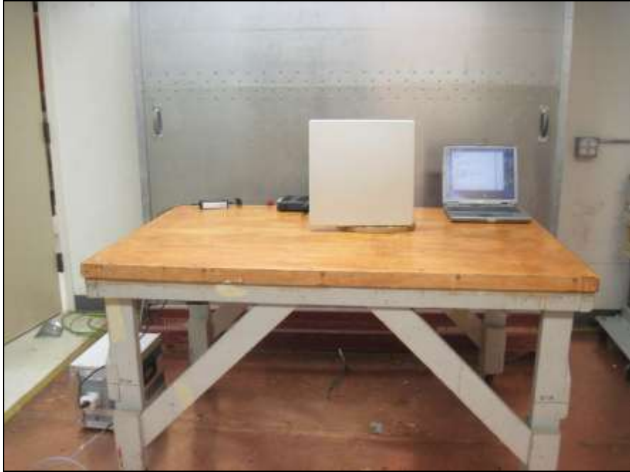
Photograph 7. Conducted Emissions, 15.207(a), Test Setup, AC/DC (1)