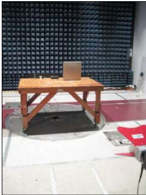
Photograph 6. Radiated Emissions, Test Setup, Above 1 GHz