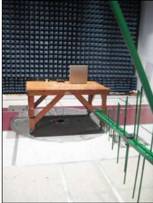
Photograph 5. Radiated Emissions, Test Setup, 30 MHz – 1 GHz