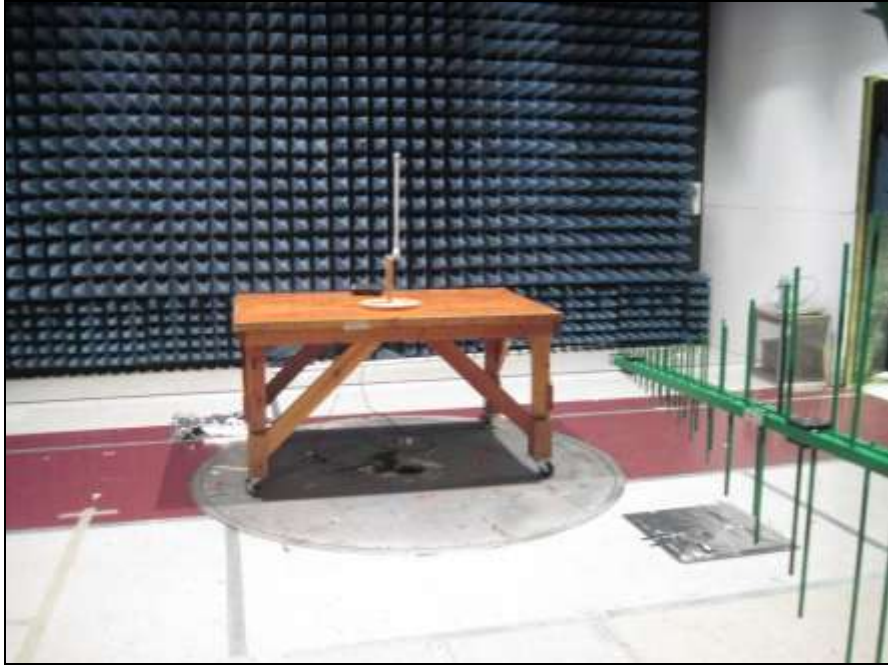
Photograph 11. Radiated Spurious Emissions, Test Setup, Omni Antenna, 30 MHz – 1 GHz