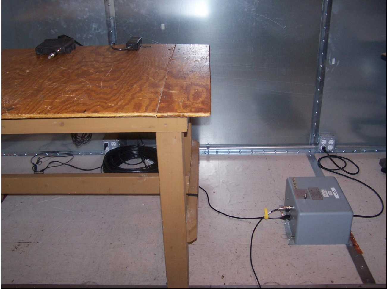
Photograph 1. Conducted Emissions, Test Setup