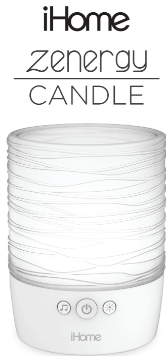
Model: iZBT110 Portable Meditative Light & Sound Therapy Candle QUESTIONS? visit www.ihome.com