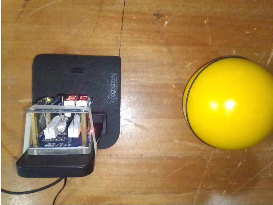
Position D (Distance 15cm)