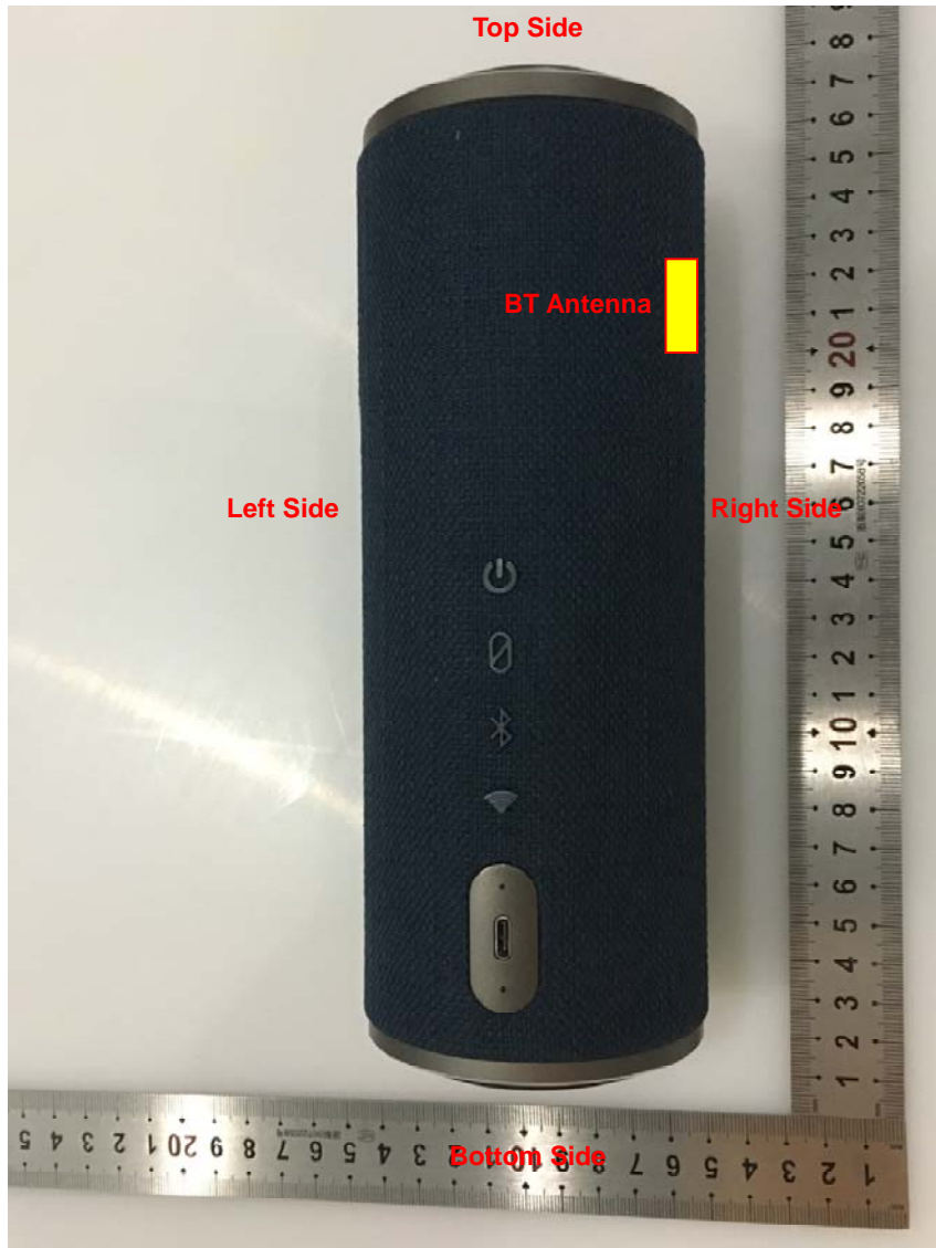
<EUT Front View>

The separation distance for antenna to edge: