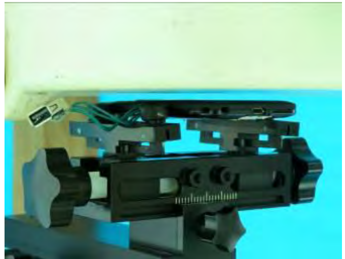
Rear Face of EUT with 0.5 cm Gap