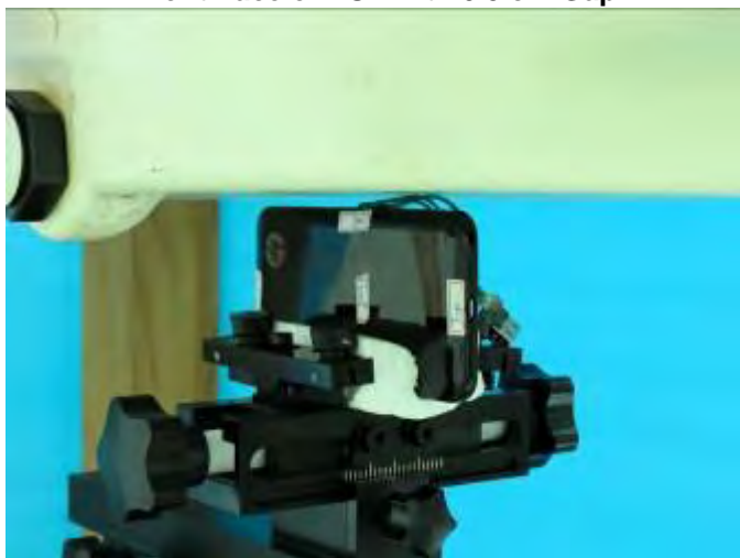
Left Side with 0.5 cm Gap