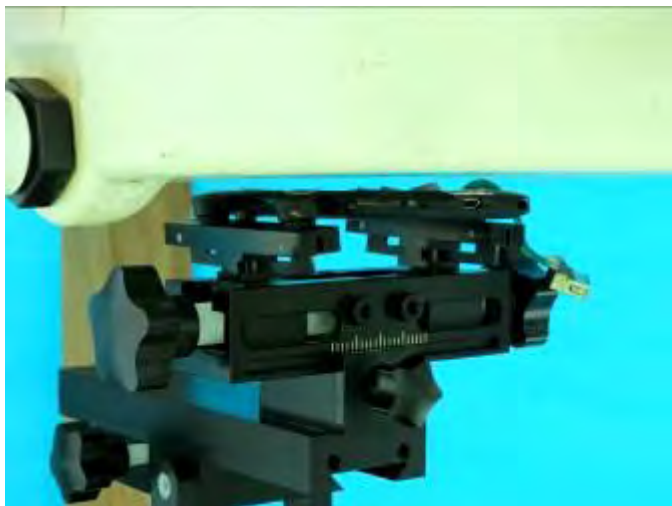
Front Face of EUT with 0.5 cm Gap