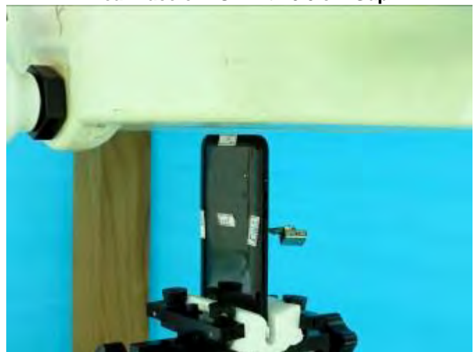
Top Side with 0.5 cm Gap