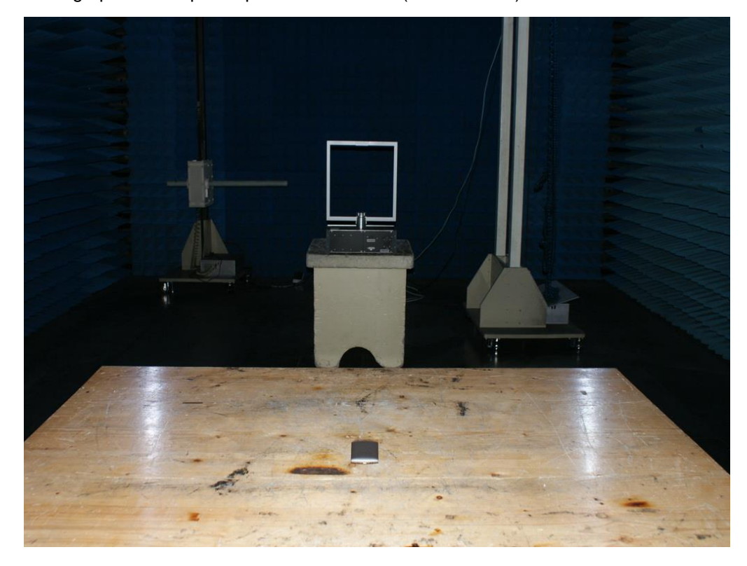
Photograph 2: Set-up for Spurious Emissions (30MHz-1GHz)