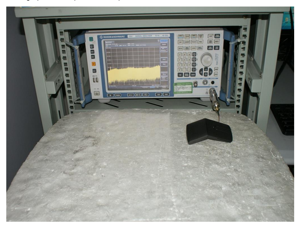
Photograph 5: Set-up for Radio Spetrum test