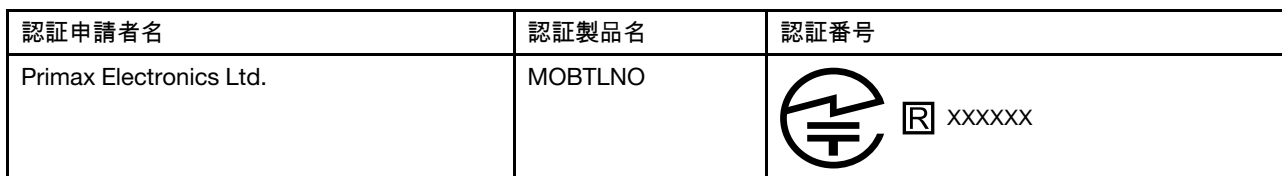
Table 1. 無線

本製品は、電波法により技術基準認証を下記のとおり取得しています。分解や改造を行うことは電波法の規定により認められていません。