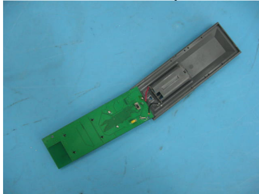
Internal View of the product