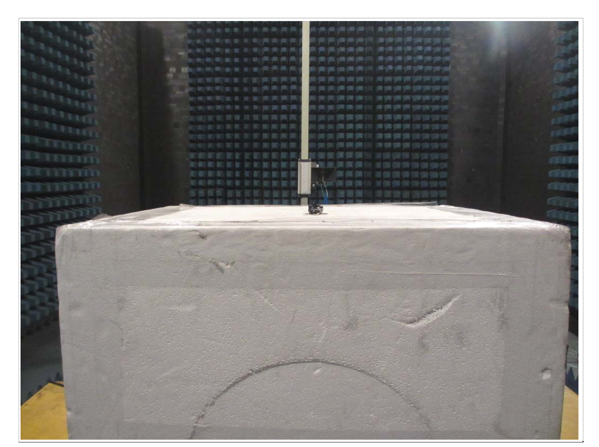
Front View of Above 1GHz