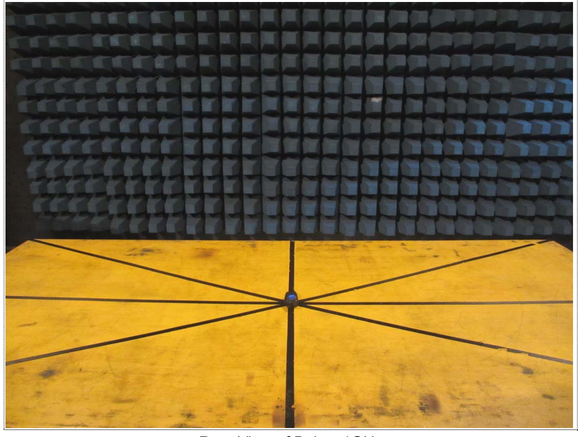
Rear View of Below 1GHz