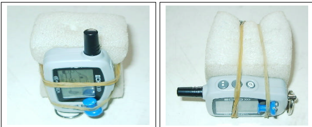
Radiated Open Site Test Set-up (Transmitter Mode)