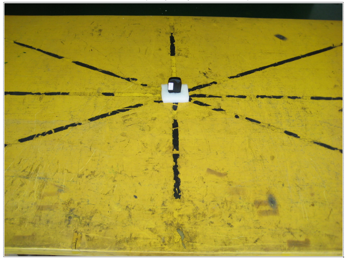
Rear View (Frequency above 1GHz)