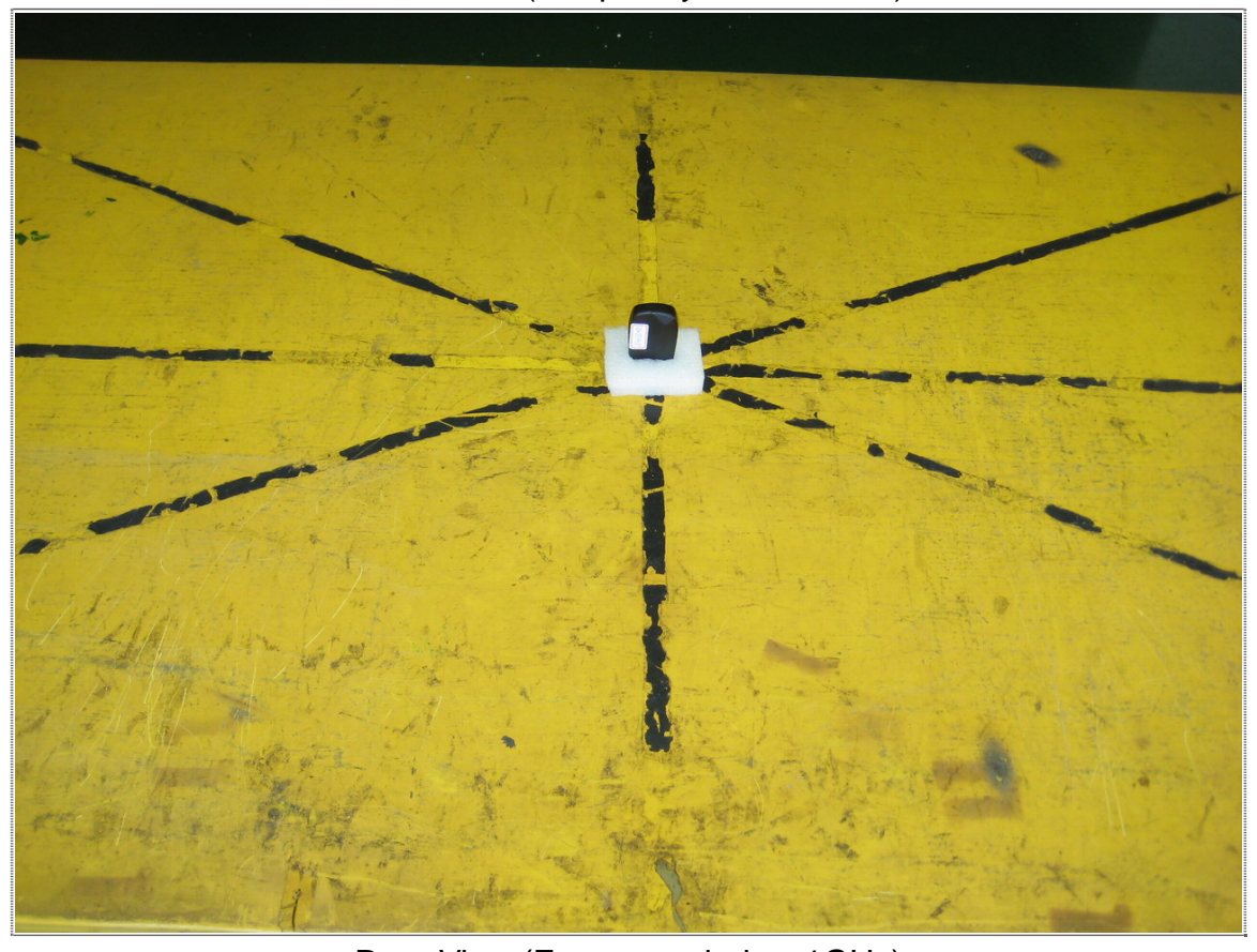
Rear View (Frequency below 1GHz)