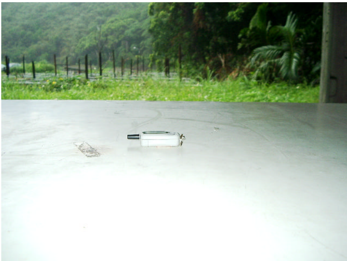
Radiated Open Site Test Set Up (Receiver Mode)