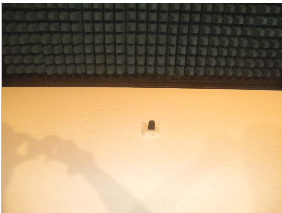
Rear View (Frequency below 1GHz)