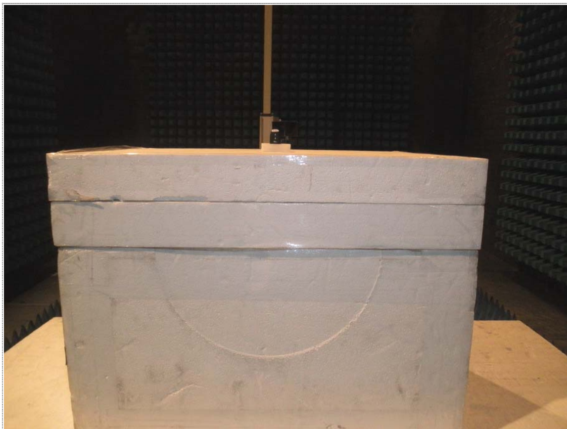
Front View (Frequency above 1GHz)