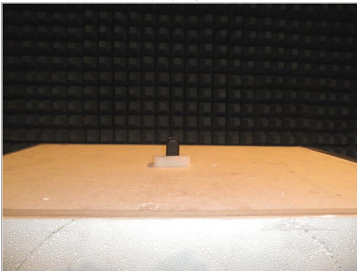
Rear View (Frequency above 1GHz)